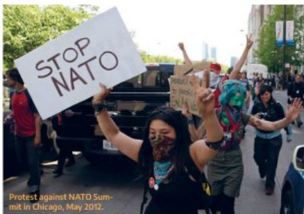
Protest against NATO Summit in Chicago, May 2012.

Blinken finally agreed to Russian Foreign Minister Sergey Lavrov's request to give a written U.S. response to Russia's draft statement on security guarantees, more than a month after it was pre-