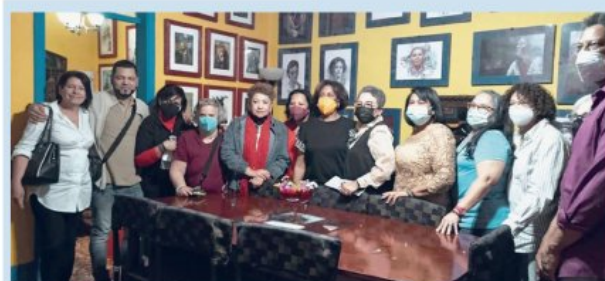
Delegation at a culture center for revolutionary art and music in Tegucigalpa.