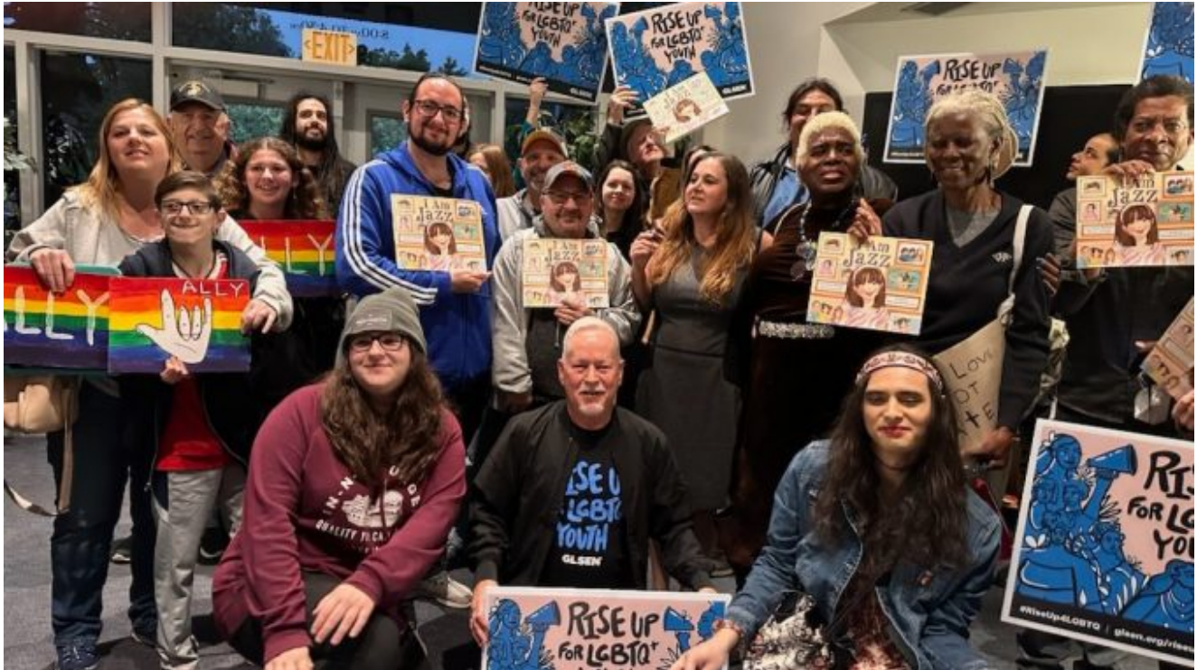
At the Santee City School Board meeting.