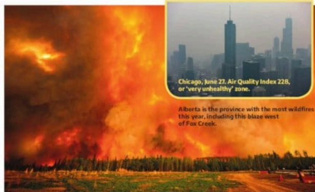
Chicago, June 27. Air Quality Index 228, or 'very unhealthy' zone.

► Puerto Rican organizations testify before UN Decolonization Committee