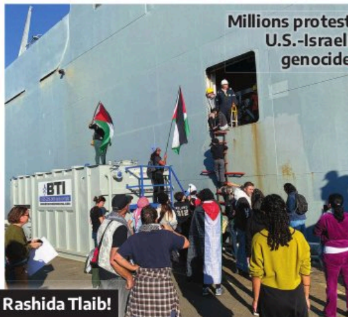
Millions protest U.S.-Israeli genocide

Protesters lashed the boat back to its mooring lines on the bollards. Three locked themselves to the ladder leading onto the ship, adding significant delay. They are currently being held in custody by the police.