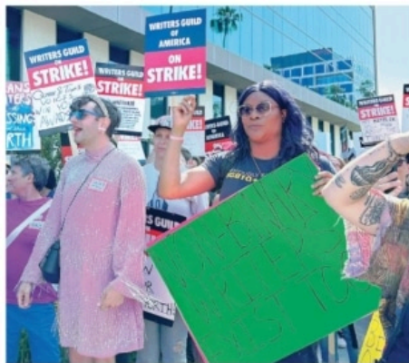
Writers Guild "Trans Takeover" picket of Netflix in Los Angeles, May 18.