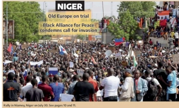
Rally in Niamey, Niger on July 30. See pages 10 and 11.

No mention is made of Trump's continuing occupation and bombing of Syria. Or his other war crimes, like the assassination of Iranian Gen. Qassem Soleimani, who was on a dip-