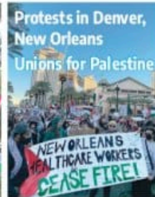
Protests in Denver, New Orleans Unions for Palestine

Detention in Egypt Jewish people fight for Palestine U.S. war spending End anti-Muslim bigotry