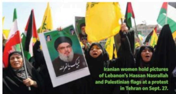
Iranian women hold pictures of Lebanon's Hassan Nasrallah and Palestinian flags at a protest in Tehran on Sept. 27.

On Oct. 1, the Associated Press reported that the Israeli Occupation Force "has moved into southern Lebanon ... opening a new front" in its war on the people of