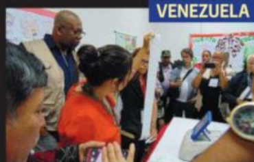
Verifying the votes at a precinct in Caracas.