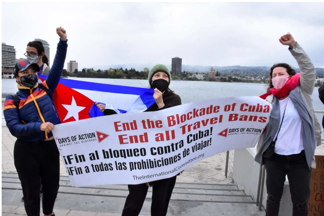
April 2021, Lake Merritt, Oakland, California.