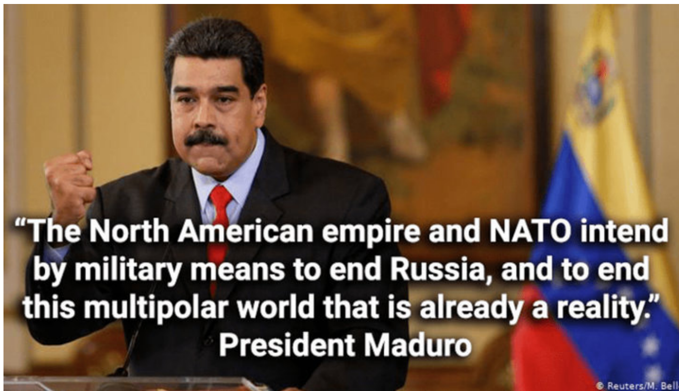
Venezuelan President Nicolas Maduro.