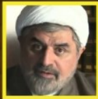
Shaykh Saeed Bahmanpour