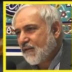
Imam Mohammad Asi