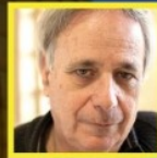
Prof. Ilan Pappé