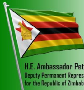
H.E. Ambassador Petronella Nyagura, Deputy Permanent Representative to the United Nations for the Republic of Zimbabwe