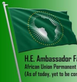
H.E. Ambassador Fatima Kyari Mohammed, African Union Permanent Observer to the United Nations (As of today, yet to be confirmed)