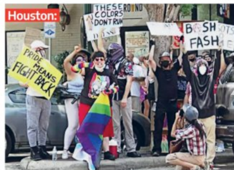
LGBTQ2S activists and anti-fascists defend a drag brunch from neo-nazis, July 10.

During Pride month in Baltimore, four houses burned and three people were hospitalized after bigots set fire to a rainbow flag on a resident's porch. In Boston, the construction site of an LGBTQ2S-friendly affordable housing project was vandalized with hate speech and threats on the weekend of July 9.