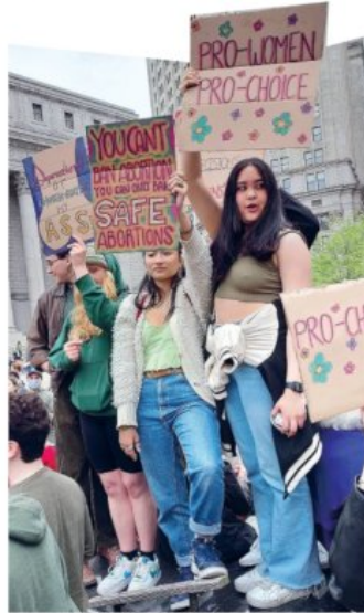
Thousands in New York protest Supreme Court attack on abortion rights, May 3.

In the blink of an eye, Biden and Congress are preparing to turn over another $33 billion to escalate the U.S./NATO proxy war on Russia and Donbass. But they remain powerless to stop the storm threatening