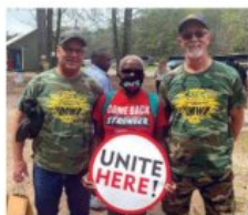
Some of the striking mine workers from Warrior Met Coal have taken jobs at the Amazon warehouse in Bessemer, Ala.