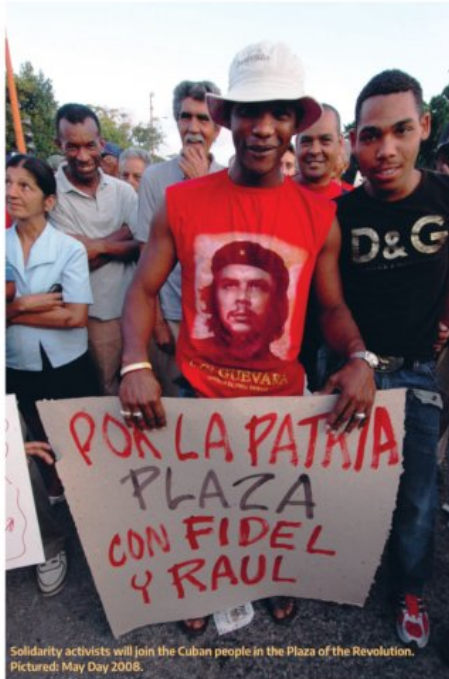
Solidarity activists will join the Cuban people in the Plaza of the Revolution. Pictured: May Day 2008.