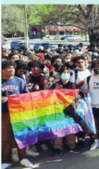
Over 1,000 students at West High School in Salt Lake City walked out of classes April 6 to protest pending anti-trans legislation in Utah.

TRANSGENDER DAY: Safe Haven vandalized 3