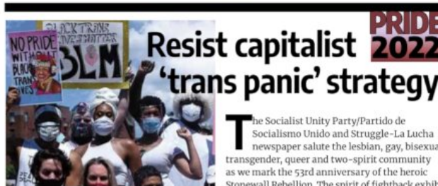
Brooklyn, N.Y., march for Black Trans Lives, June 2020.