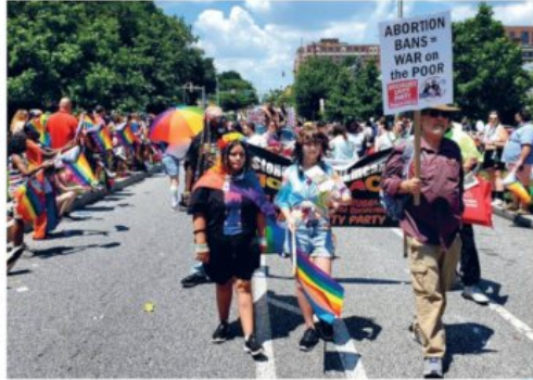
'Abortion bans = war on the poor': Baltimore Pride March, June 25.