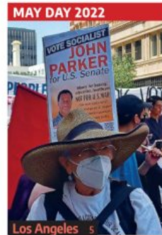
Los Angeles 5

Socialist Senate candidate on fact-finding trip to Russia, Donbass 5, 6