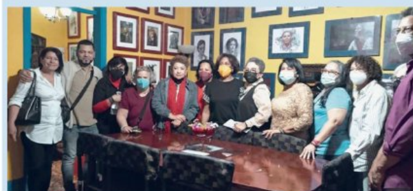
Delegation at a culture center for revolutionary art and music in Tegucigalpa.