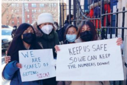
Students at Lower East Side Prep High School joined a citywide walkout for COVID safety in New York, Jan. 11.