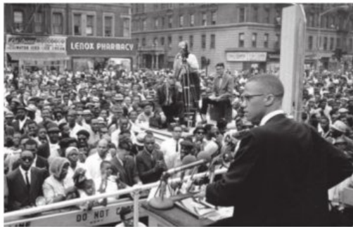
Malcolm X speaking in Harlem in New York City on June 29, 1963. J. Edgar Hoover sent a telegram to the New York FBI office on June 6, 1964, demanding that they "do something about Malcolm X."

Black leaders have been targeted by the U.S. Government for over a century. The army considered Dr. Martin Luther King Jr. to be a threat. FBI Director J. Edgar Hoover wanted him dead.