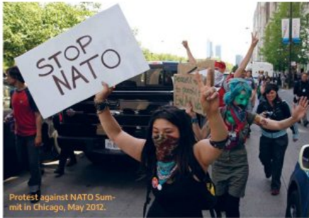
Protest against NATO Summit in Chicago, May 2012.

Blinken finally agreed to Russian Foreign Minister Sergey Lavrov's request to give a written U.S. response to Russia's draft statement on security guarantees, more than a month after it was pre-