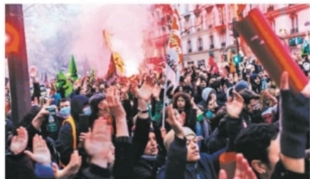
Workers across France continue militant protests against attacks on pensions.