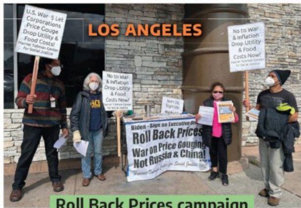
Roll Back Prices campaign