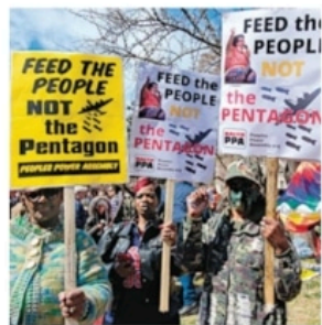
March 18 protest in Washington, D.C.