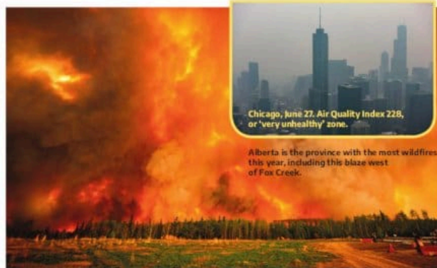
Chicago, June 27. Air Quality Index 228, or 'very unhealthy' zone.

► Puerto Rican organizations testify before UN Decolonization Committee