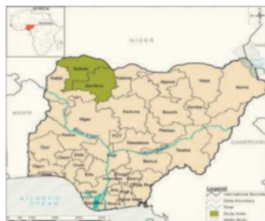
Map of Nigeria highlighting Sokoto State, site of U.S. Christmas airstrikes, and Zamfara State, a neighboring region affected by ongoing violence in northwest Nigeria.