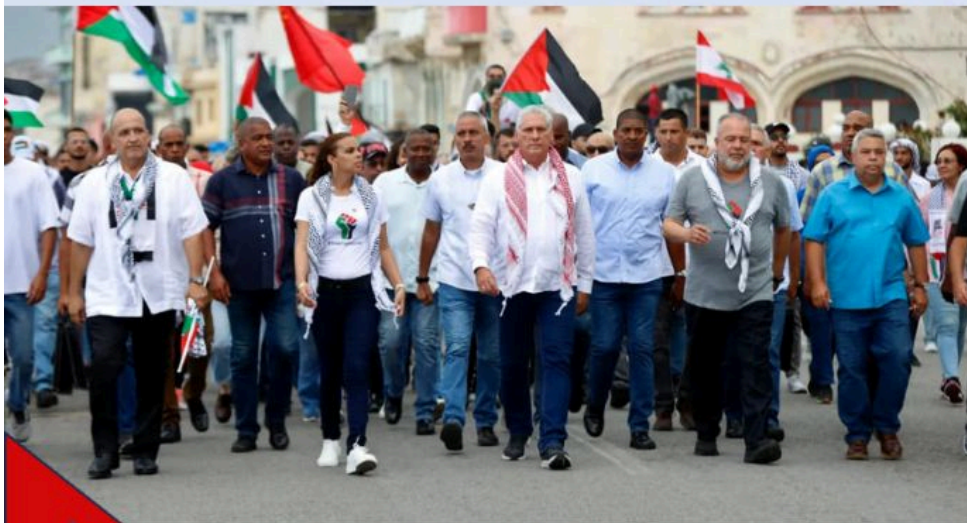
Cuban President Miguel Diaz-Canal (CR) and Prime Minister Manuel Marrero (2R) during a rally in solidarity with Palestine.