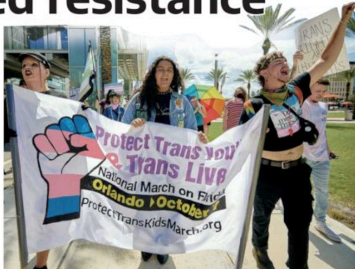
National March for Trans Youth in Orlando, Florida, Oct. 7, 2023.