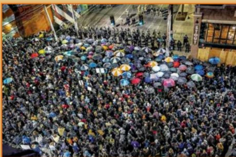
Several thousand people standoff with police outside the Seattle Police Department East Precinct on June 2, 2020, during the national uprising for George Floyd. It is the mass movement that kept Trump in check during his first term, not the Democratic Party.