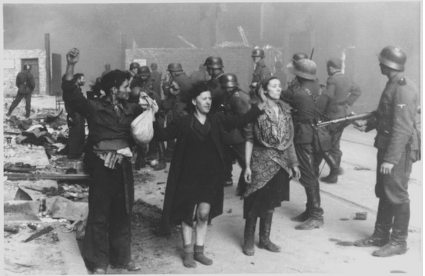
Captured fighters from the Warsaw Ghetto Uprising in 1943.

written by Struggle - La Lucha April 21, 2020