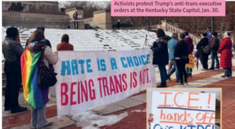
Activists protest Trump's anti-trans executive orders at the Kentucky State Capitol, Jan. 30.