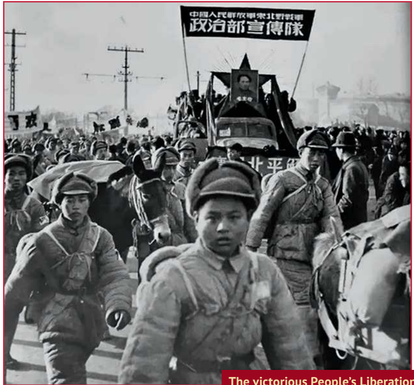
The victorious People's Liberation Army enters Beijing in 1949.

To understand China today means looking at how a workers' state was built,