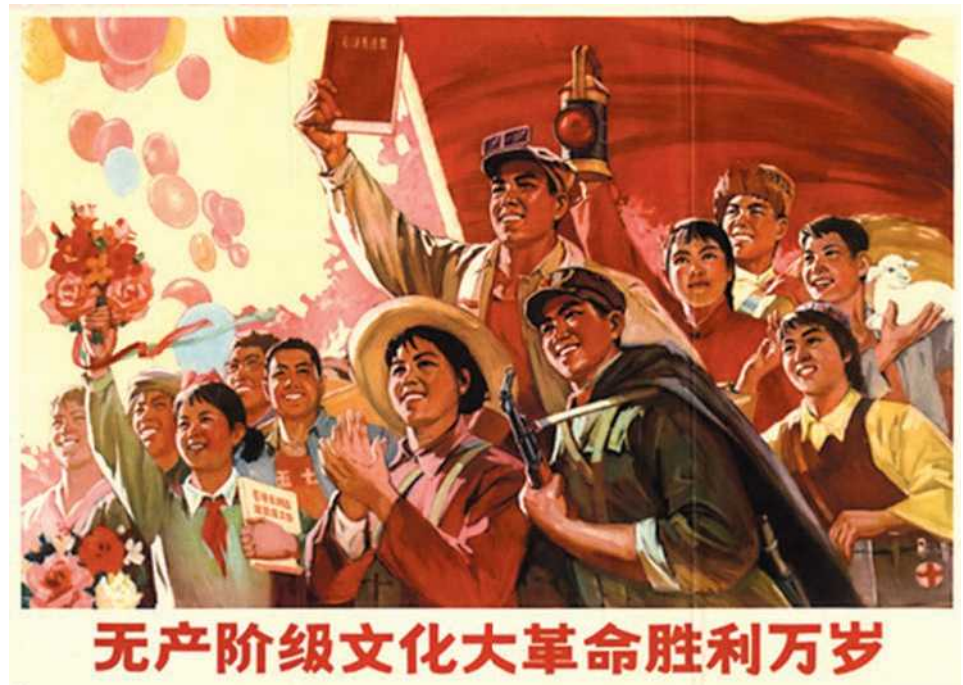
A 1976 Cultural Revolution poster celebrating mass participation in socialist transformation — linking armed defense, revolutionary culture, grassroots healthcare, and the solidarity of China's nationalities, including Uyghur and Tibetan peoples.

By the late 1960s, the conflict spiraled into border clashes, giving imperialism an opening it had long sought. The tragedy is that the split was not a clash between two social systems, but the triumph of the dangers Lenin warned about: bureaucratic narrowness, the great-nation chauvinist habits the Chinese had long criticized, and the ongoing pull of old privileged hierarchies.