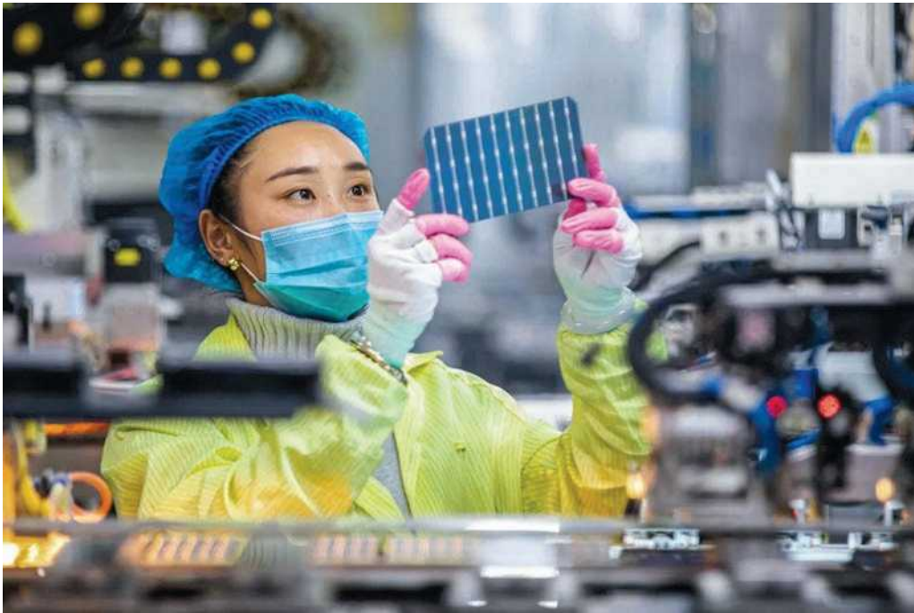
A worker checking solar photovoltaic modules used for small solar panels at a factory in Haian. China's rise in advanced industry rests on collective labor, not colonial plunder.

coercion: bases, alliances, interventions, and the global command structure that enforces the capitalist order. The United States maintains roughly 750-800 foreign bases; China has one. The U.S. operates worldwide combatant commands; China does not.