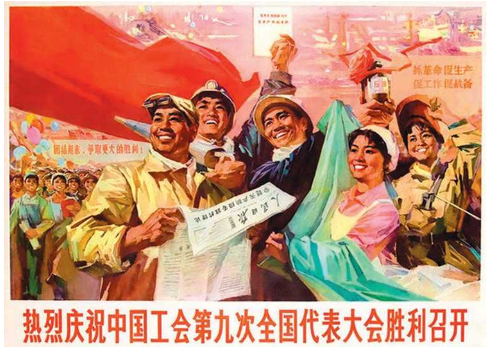
'Celebrate the 9th Congress of the Industrial Union,' 1960.

The same was true of surplus value. Workers still perform surplus labor under