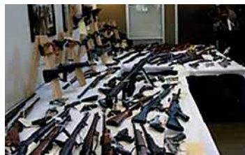
U.S. fuels organized crime in Latin America with illegal weapons

U.S.-made weapons fuel violence in several regions. "In the case of Latin America, it is known that a significant number of guns recovered at crime scenes were either manufactured in the United States, or first imported into the United States and then illegally trafficked," they stated. For example, 98% of illegal guns in Haiti and the Bahamas come from the United States. In Mexico this figure reached 70% in the last decade. In the 7 Central American countries, 50% of illegal weapons come from the US.