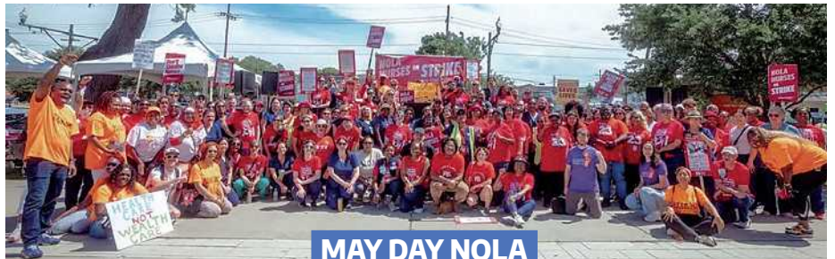
MAY DAY NOLA