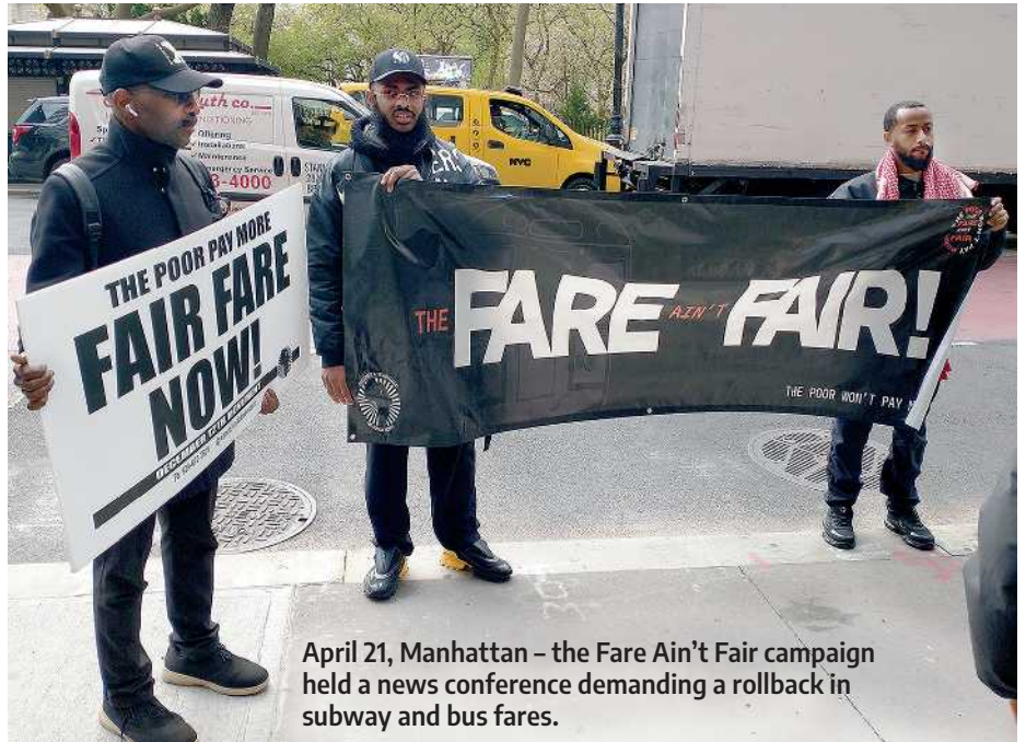
April 21, Manhattan – the Fare Ain’t Fair campaign held a news conference demanding a rollback in subway and bus fares.