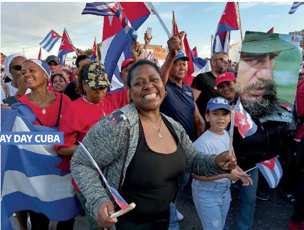
MAY DAY CUBA