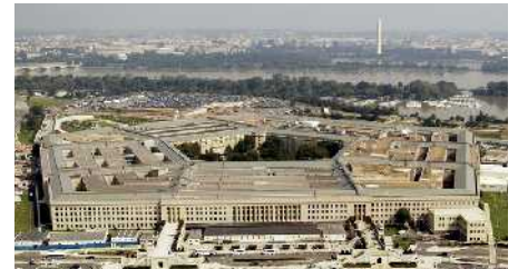
The Billionaire-Military Complex - The Pentagon.