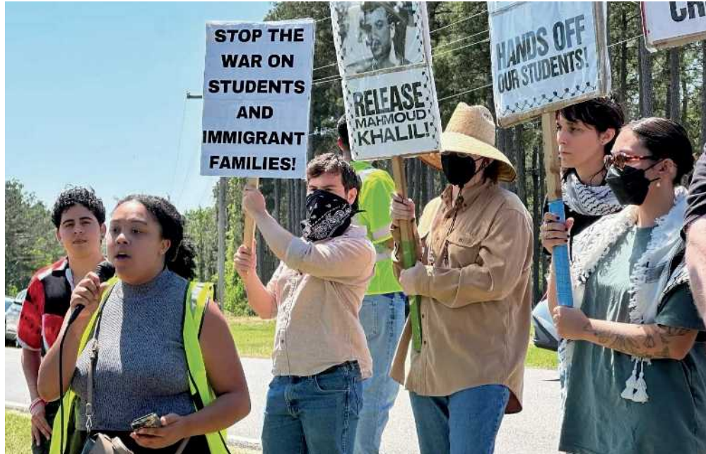
People traveled from across the Deep South on April 15 to take part in a protest at an ICE prison in Jena, Louisiana.

Marches, rallies, and actions to inspire courage among the people are all part of the fight against fascism. We will build our strength that much more by bringing the movement into our workplaces and working-class