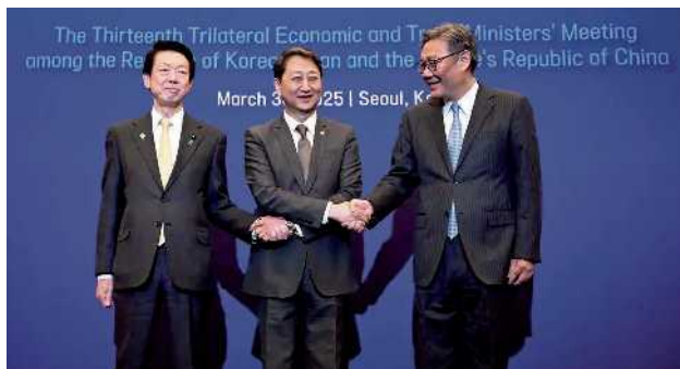
Trade ministers (from left to right): Japanese Industry Minister Yoji Muto; South Korean Industry Minister Ahk Duk-geun; Chinese Commerce Minister Wang Wentao.