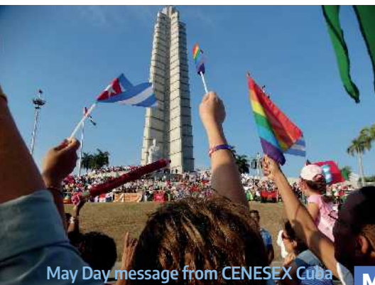
May Day message from CENESEX Cuba