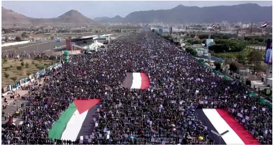
On April 25, following U.S. airstrikes, massive crowds rallied in Yemen's capital city, Sanaa, raising aloft both the Palestinian and Yemeni flags.

No imperialist state, including the U.S., can sustain capitalism in isolation. Their wealth and capital accumulation depend critically on extracting value from the Global South through unequal trade relations, securing super-profits that far exceed average returns. Even non-market activities, such as war production, rely on efficiencies derived from globalized supply chains and labor hierarchies. Ultimately, imperialist dominance is meaningless without mechanisms to exploit that power — a reality inseparable from capitalism's drive for profit. #