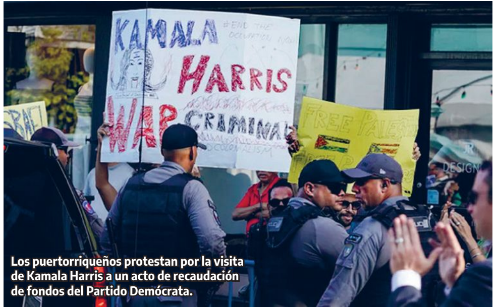
Los puertorriqueños protestan por la visita de Kamala Harris a un acto de recaudación de fondos del Partido Demócrata.

Resalta sin embargo, una muy peculiar que encierra en sí las contradicciones de su visita. Como cuando visitó el Taller La Goyco en Santurce. Éste se encuentra en el edificio de una escuela que fue clausurada durante la criminal ola de cierres por el gobierno en el