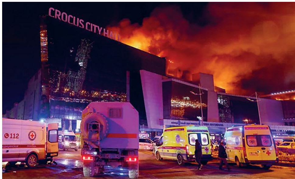
On March 22, Russian emergency services vehicles parked near the burning Crocus concert hall outside Moscow.

ISIS-Khorasan (ISIS-K) is reported to have claimed responsibility for the attack. Following the fall of the U.S.-backed Afghan regime, a significant number of former members of the Afghan National Defense and Security Forces (ANDSF) reportedly joined ISIS-K. There are reports that the CIA has been supplying ISIS-K with weapons and matériel. That ISIS-K was involved may be accurate, providing mercenary foot soldiers.