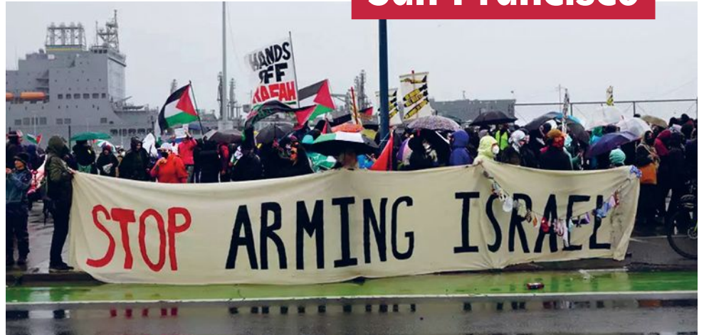
Protesters for Palestine at the Port of San Francisco, March 29.

“The United States has trillions of dollars for the military. Yet people are suffering in the United States. We need health care. We need safety for queer