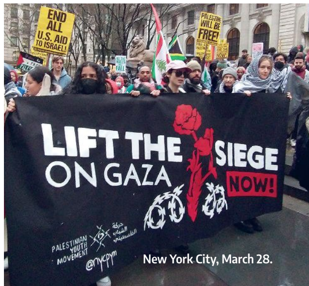
New York City, March 28.

Bill Clinton bombed socialist Yugoslavia for 78 days and killed thousands in Iraq with sanctions that prevented importing vital goods. Barack Obama’s invasion of Libya led to slave markets being set up in the African country.