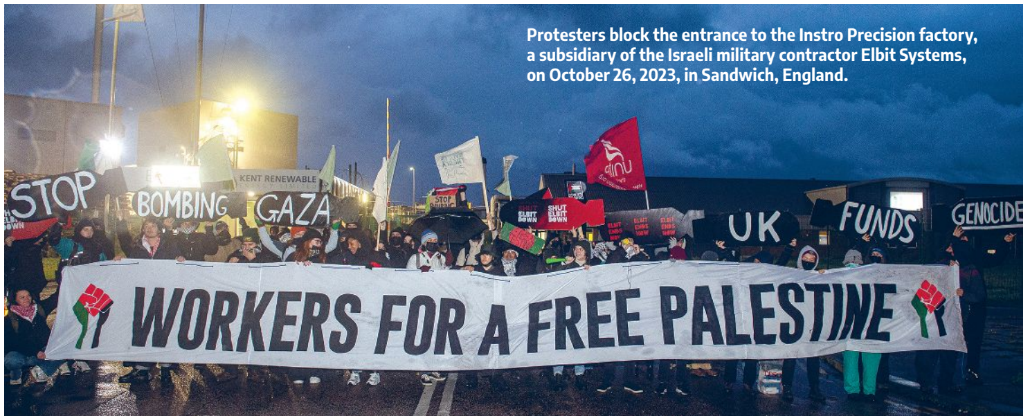
Protesters block the entrance to the Instro Precision factory, a subsidiary of the Israeli military contractor Elbit Systems, on October 26, 2023, in Sandwich, England.