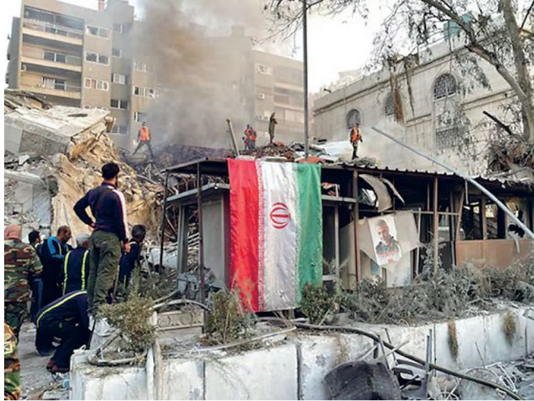
An Iranian flag hangs as smoke rises after an Israeli airstrike on the Iranian embassy in Damascus, Syria, on April 1.

Israel has conducted numerous attacks in Syria and Lebanon. This strike marks the first Israeli attack on Iranian diplomatic territory.