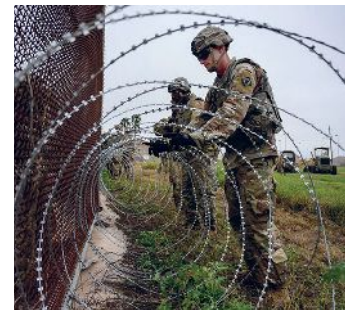
Soldiers put concertina wire on a border fence near the Brownsville and Matamoros Express International Bridge in Brownsville, Texas.

The reality is that the Biden administration has continued many of the more repressive Trump-era immigration policies.