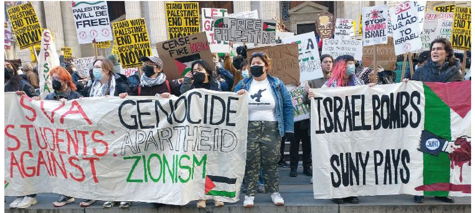
Feb 16 protest.

As was done during the 1980s struggle against the then apartheid South Africa, students are demanding their schools divest from the apartheid regime occupying Palestine. Students from the State University of New York carried a banner, "Israel Bombs / SUNY Pays."