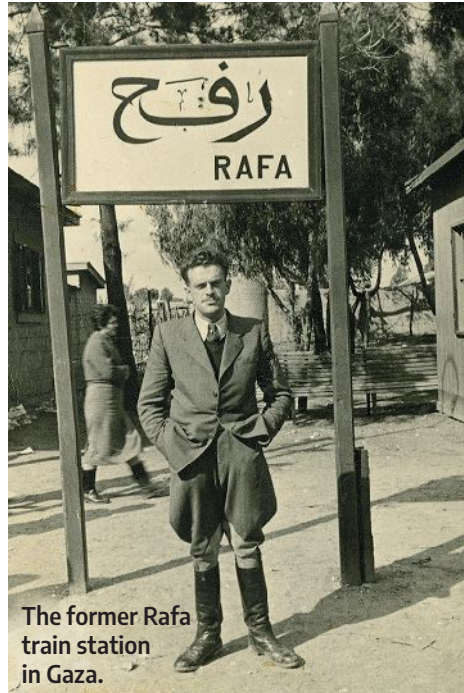
The former Rafa train station in Gaza.

Three days after the derailment, on Feb. 6, 2023, Norfolk Southern deliberately ignited five tank cars that released a mushroom cloud of dangerous toxins.