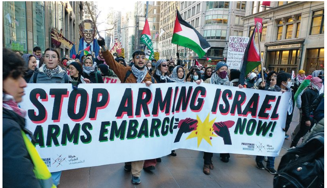
New York City protest on Feb. 16. See page 3.