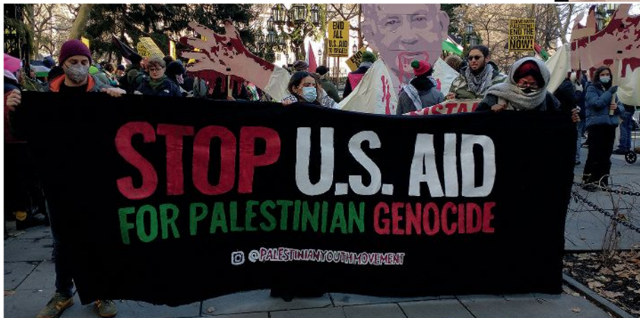
Protesters march on Wall Street for Gaza, Jan. 8.