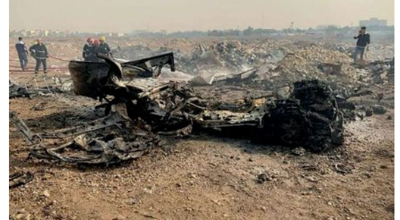
Aftermath of deadly U.S. drone strike in Iraq on Jan. 4, 2024.

These sort of targeted killings against government-affiliated officials by the