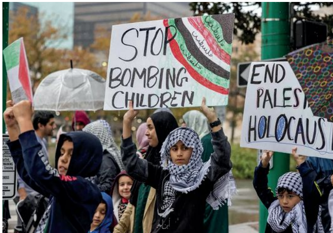
Demonstrators rally in support of Gaza in Norfolk, Virginia, on Oct. 14, 2023.

People in the United States didn't want another Vietnam War, this time in Central America. Congress refused to finance the contras.