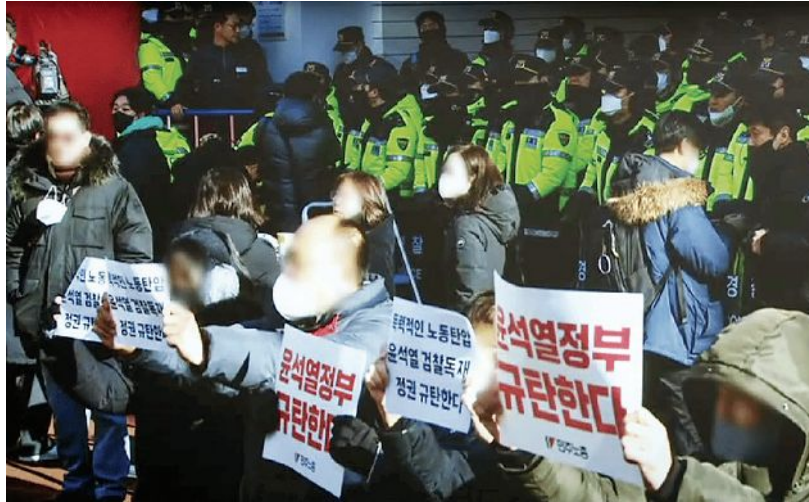
South Koreans protest the anti-communist National Security Law.

An Arab boy, aged 5, loses his life, and his mother is critically injured as a