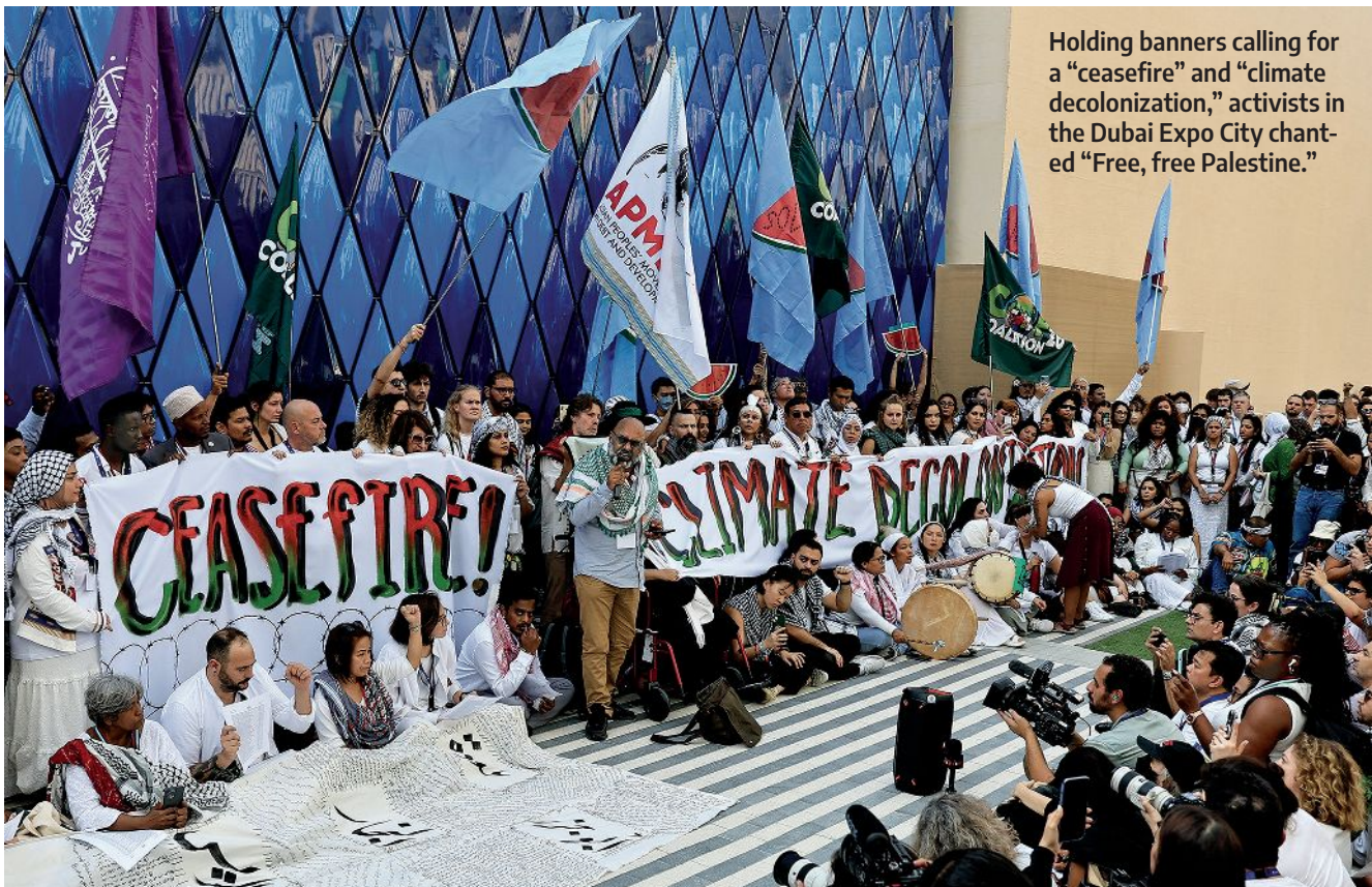
Holding banners calling for a “ceasefire” and “climate decolonization,” activists in the Dubai Expo City chanted “Free, free Palestine.”

During the Sharm el Sheik conference Continued on page 10