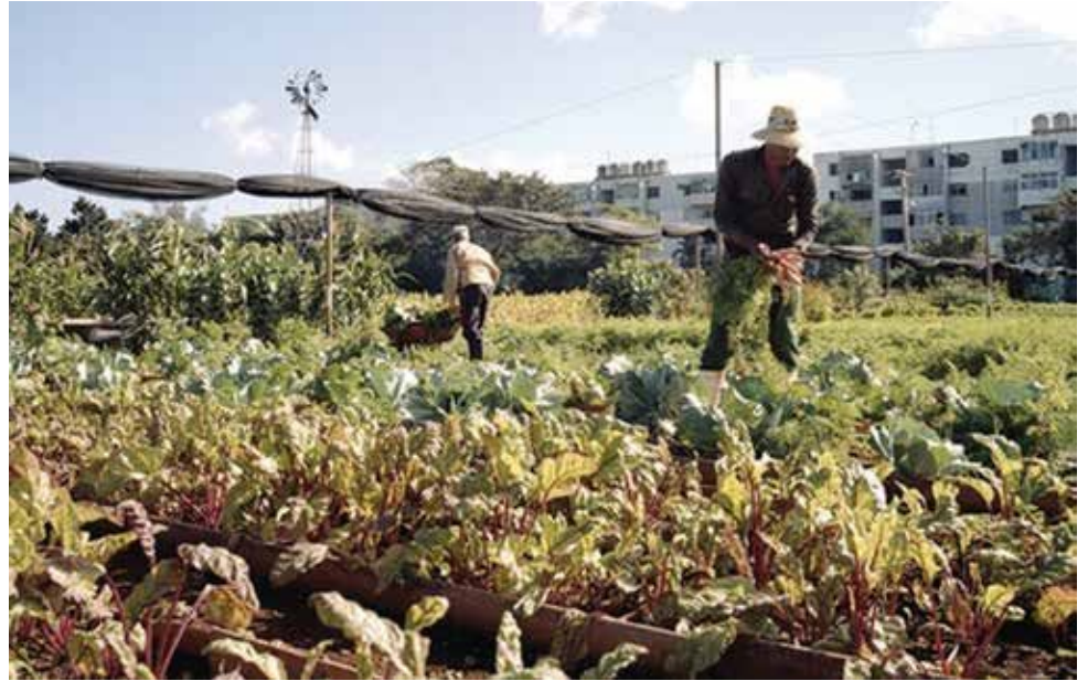
Urban farmers harvest carrots in Havana. Making cities more self-sufficient in food production has cut down on dangerous emissions.

In a speech at the 1992 Earth Summit, the Cuban president said: "They have poisoned the seas and rivers, polluted the air, weakened and punctured the ozone layer, saturated the atmosphere with gases which are changing weather conditions with a catastrophic effect we are already beginning to experience.