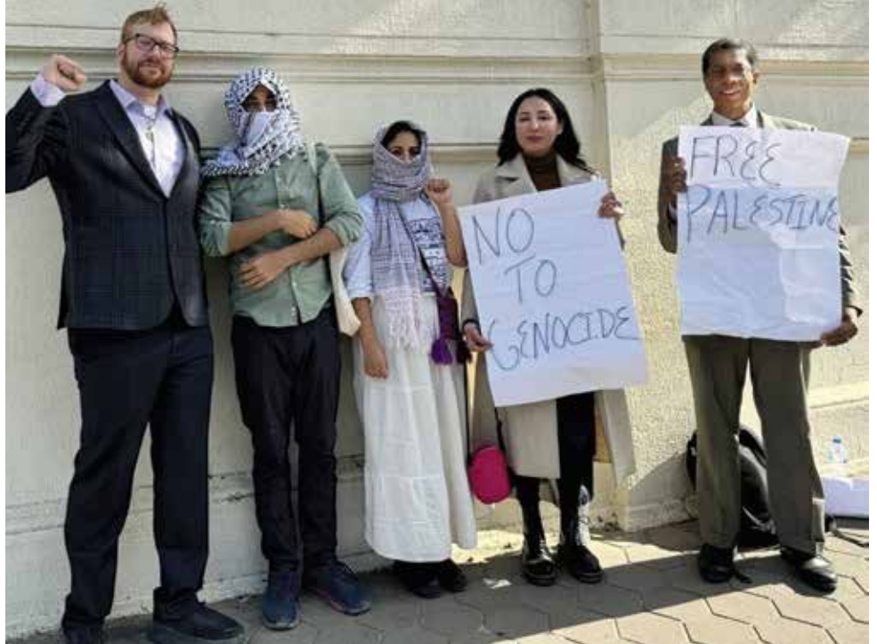
U.S. delegates of the Convoy outside the U.S. Embassy in Cairo, Egypt, Nov. 27.