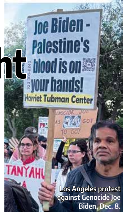
Los Angeles protest against Genocide Joe Biden, Dec. 8.