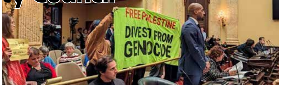
Protesters demand Baltimore City Council action against genocide in Gaza, Dec. 4.

The activists complied and split into two groups: those in a cramped “over-