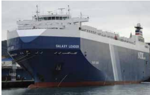
The Galaxy Leader was seized in the Red Sea and redirected to the Port of Hodeidah in Yemen by the Houthi-led Yemeni Armed Forces.

Statements from the YAF have also confirmed that they have fired a salvo of winged missiles targeting Zionist occupying forces in the Eilat region (occupied Umm Al-Rashrash, Palestine) and will continue to strategically target the Zionist regime until they end their aggression towards the people of Palestine.