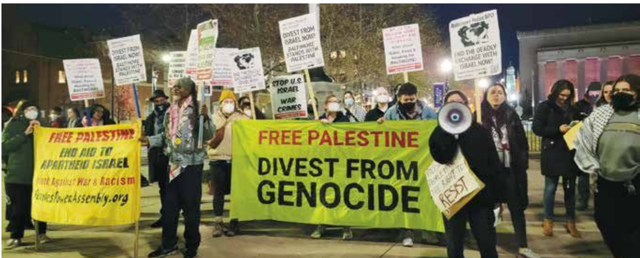
Protest continued after Baltimore Police drove activists out of City Hall.

Ceasefire now! Divest now! Free Palestine now! #