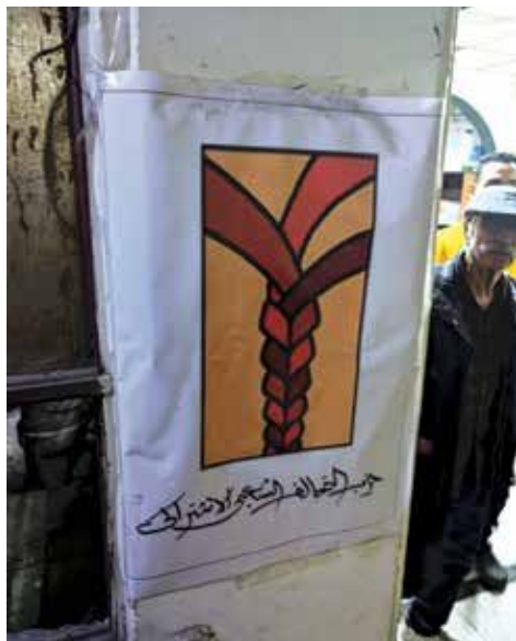
Poster in Cairo displays the symbol of Egypt's Popular Socialist Alliance Party (SPAP).