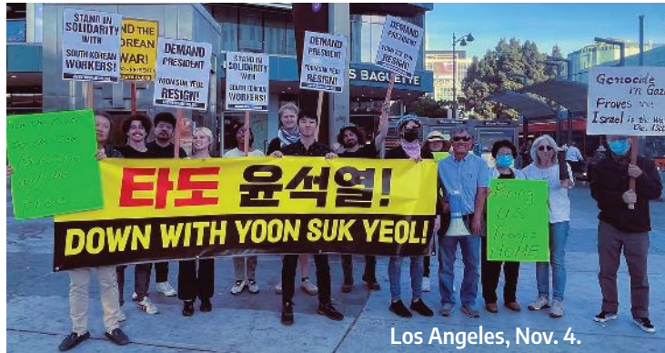
Los Angeles, Nov. 4.