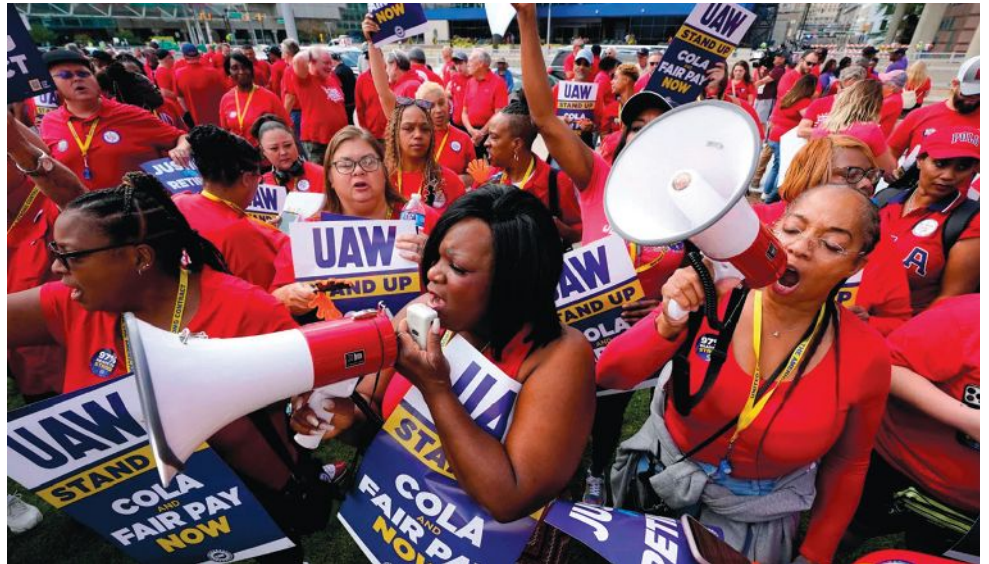
United Auto Workers strike rally in Detroit on Sept. 15.

Why aren't Trump and the rest of the billionaire criminals locked up instead? The labor movement needs to demand "jobs, not jails!"