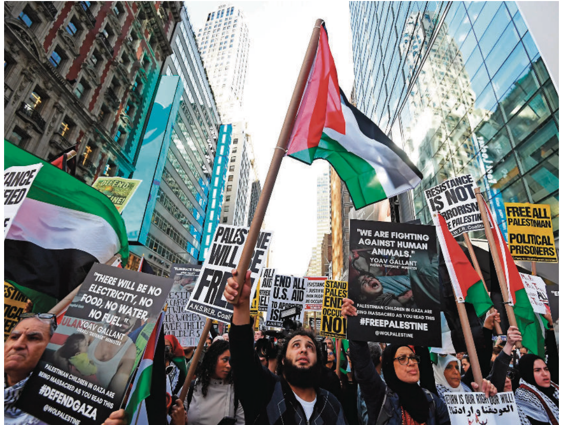
Times Square, NY on Oct. 13.

Similarly, a favorite Zionist slogan was “a people without land for a land without people.” This implied that Palestine was uninhabited.