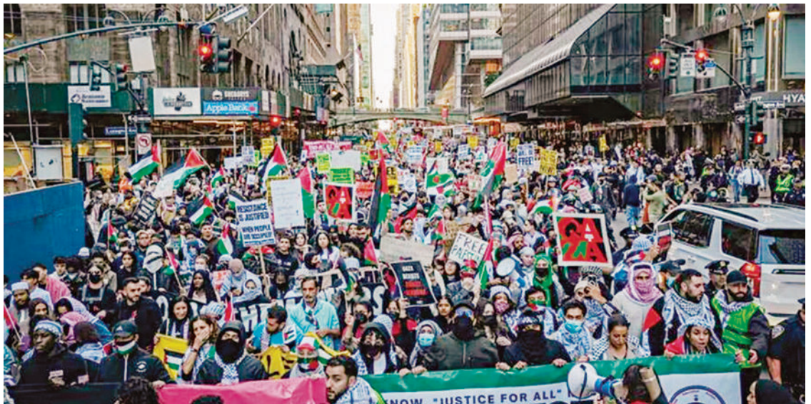
Thousands flooded into Times Square, NY on Oct. 13

Half of the Gazans in this immensely crowded prison have now been ordered to flee to the southern