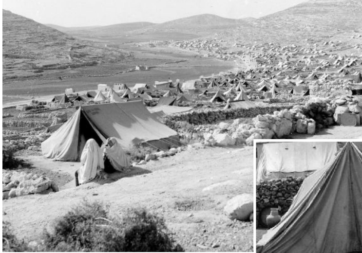
Fawwar Refugee camp, 1950s.

The new escalation began this time with the Hamas attack, but the revanchist and vengeful mood that now reigns in media and networks, and which naturalizes the conception of Palestinians as animals worthy of being led to the slaughter, completely forgets that Israel has been adding fire to the pressure cooker for years and it finally burst last Saturday. Foreign Policy in Focus has compared the current situation in Gaza to the Attica, New York, prison riot in 1971, which ended in a bloodbath: “If you put prisoners in a cage and torture them, they will revolt.”