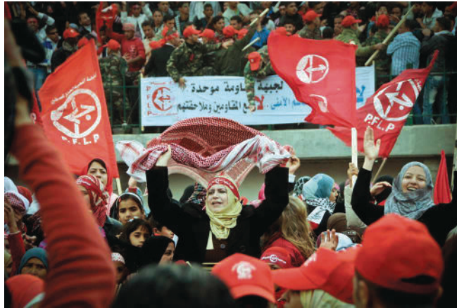
PFLP rally in Gaza.

The Front believes that the U.S. administration hastened these urgent decisions to try to contain the strategic results of the Al-Aqsa Flood Bat-