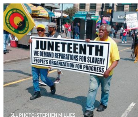
SLL PHOTO: STEPHEN MILLIES