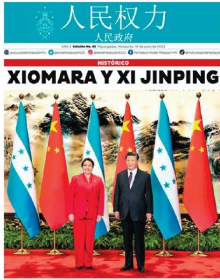
La histórica reunión de los presidentes Xiomara Castro y Xi Jinping ha enfurecido a la derecha respaldada por Estados Unidos en Honduras.

Y su respuesta es atacar ferozmente al gobierno del Socialismo Democrático, no solo a través de la guerra mediática, sino que hasta perpetrando crímenes como los ataques terroristas contra la Empresa Nacional de Energía Eléctrica Hondureña (ENEEH) y produciendo fatales apagones que le causan terribles daños al pueblo, así como lo denunció el ministro Erick Tejada en cadena nacional el pasado, mar-