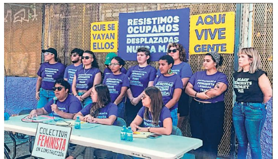
En marzo, la Colectiva Feminista en Construcción llevó a cabo una conferencia de prensa en la que denunció el rol del estado en las políticas de desplazamiento que sufre la comunidad de Río Piedras.

Pero cada vez hay más grupos comunitarios, ambientalistas, de apoyo mutuo y de organizaciones progresistas que van uniéndose voluntades para enfrentar esta agresión,