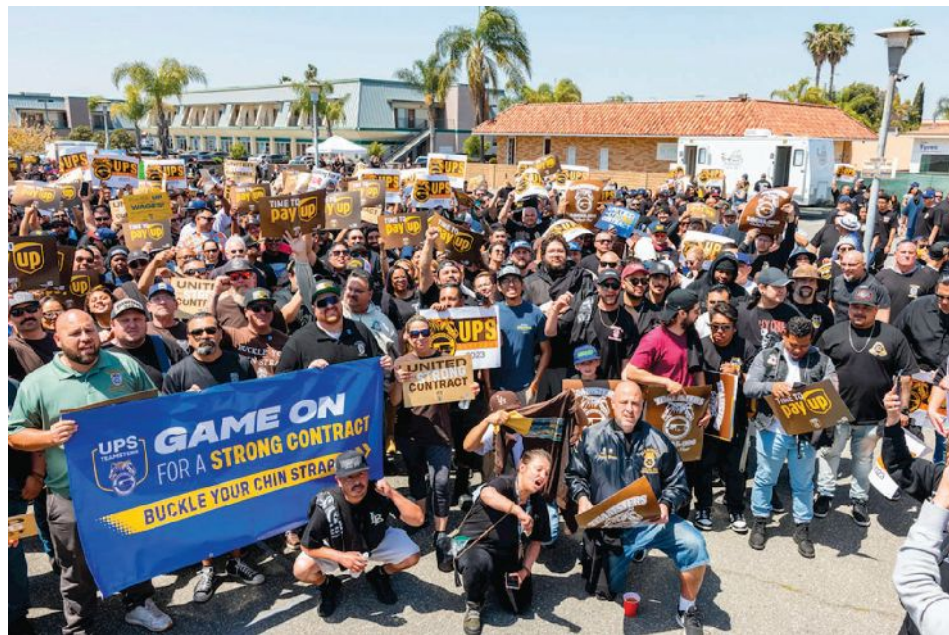
Southern California Teamsters who work at United Parcel Service (UPS) facilities throughout the region held a solidarity rally on April 15.

The union called for a strike when contract negotiations between Glacier Northwest and the local Teamsters union broke down. Drivers walked off the job following the union’s instructions to bring their trucks back to Glacier’s facility and to leave the trucks’ mixing drums spinning so that the concrete could be dumped before it began to harden.