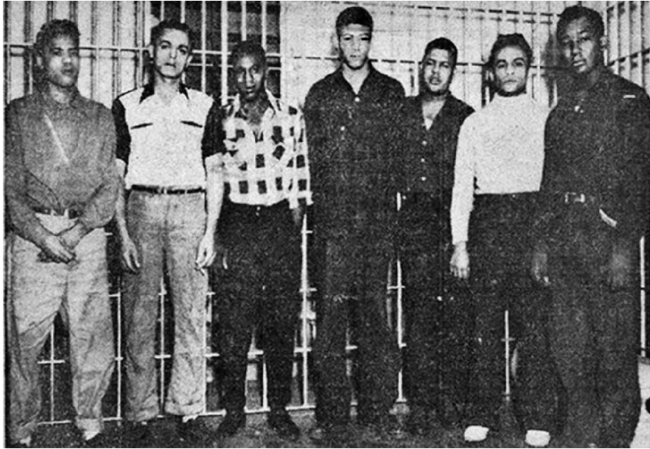
Pat Robertson walked in the footsteps of the Byrd political machine, which engineered the 1951 legal lynching of the Martinsville 7. These innocent Black men were posthumously pardoned in 2021.

Yet Robertson had the biggest business empire of all the right-