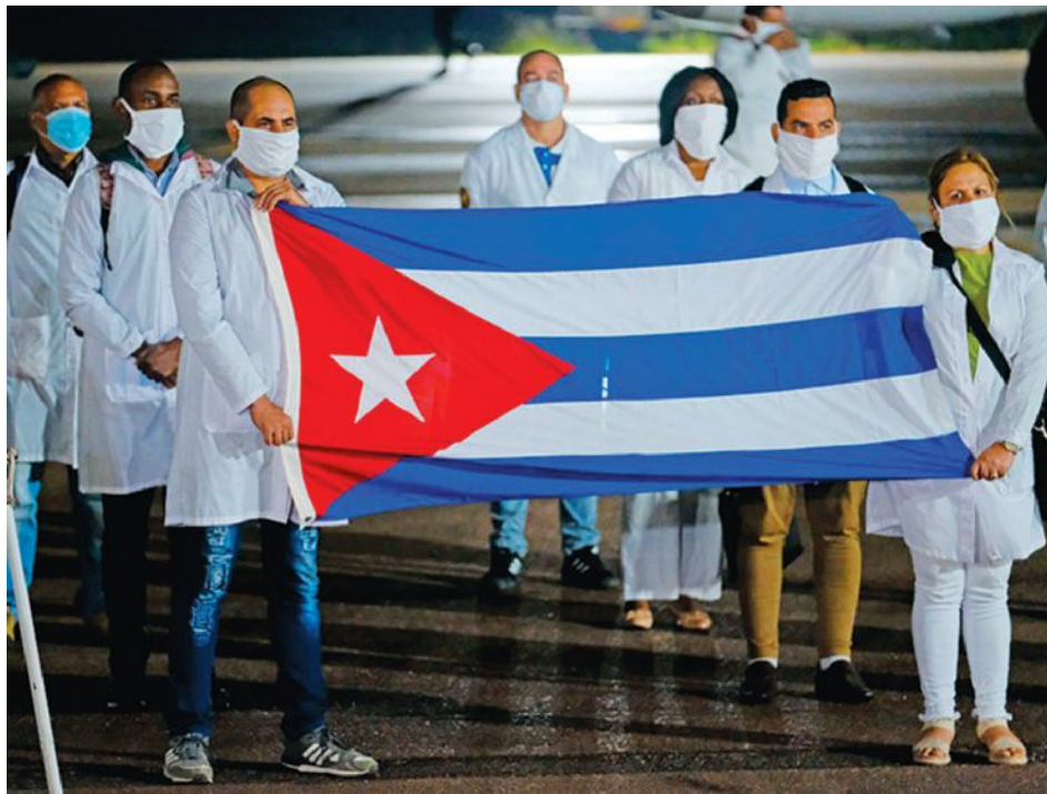
Cuban health care workers went to South Africa and many other countries to fight the COVID-19 pandemic.

Vacationing is strictly forbidden, as is staying at a hotel, drinking the wrong cola, or even buying a book from an entire Cuban publishing house. Honestly, the U.S. government spends our tax dollars making detailed lists of what is forbidden in Cuba. Such is the unique "freedom to travel" to Cuba.