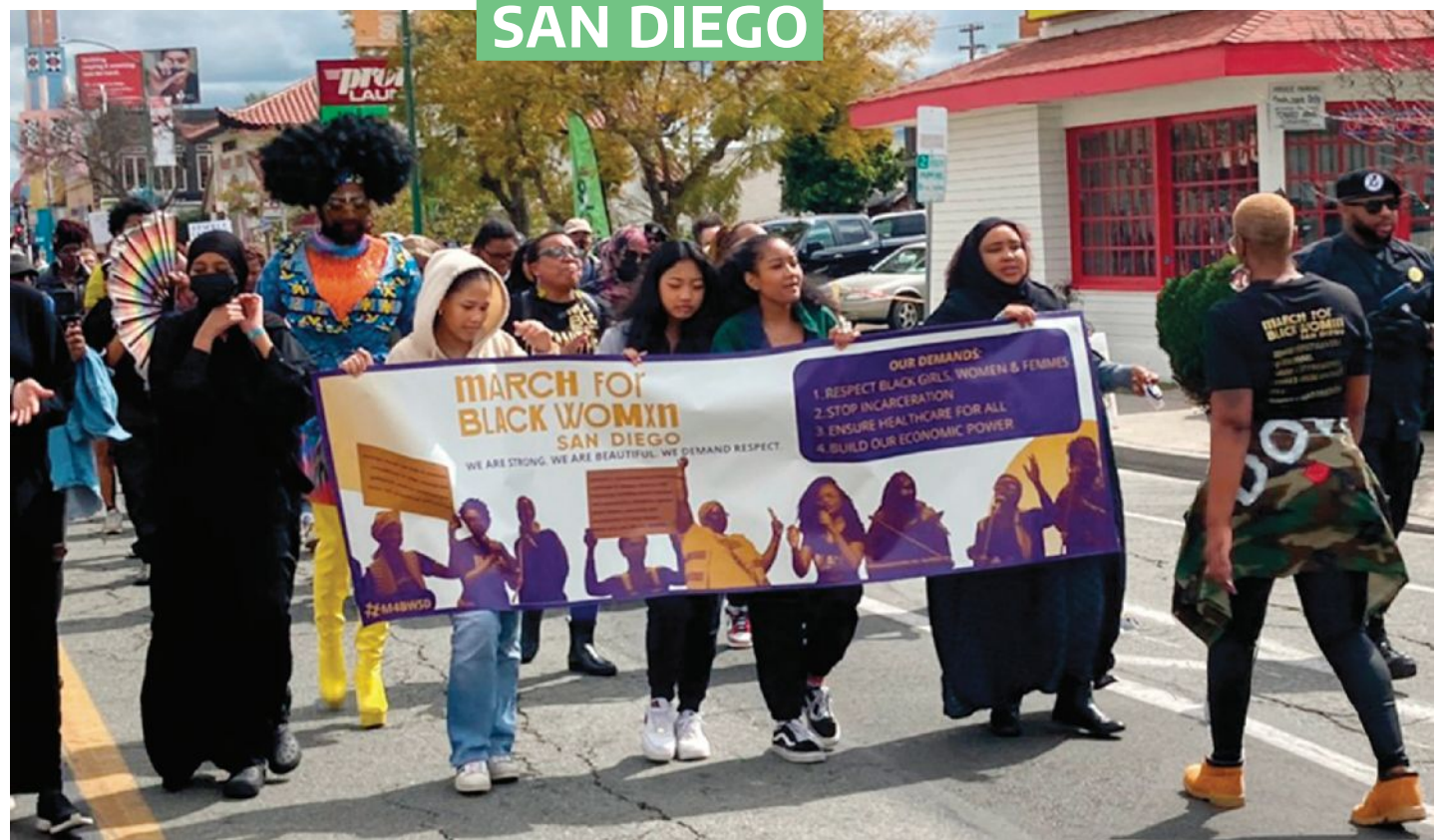
March for Black Womxn 2023 in San Diego, March 12.