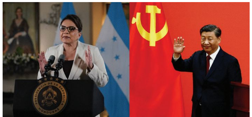
Honduran President Xiomara Castro and Chinese President Xi Jinping.

5. For maintaining a firm and forceful anti-imperialist, anti-colonial, anti-neoliberal, anti-capitalist, and anti-patriarchal stance, especially in the international forums in which she has participated since taking office: