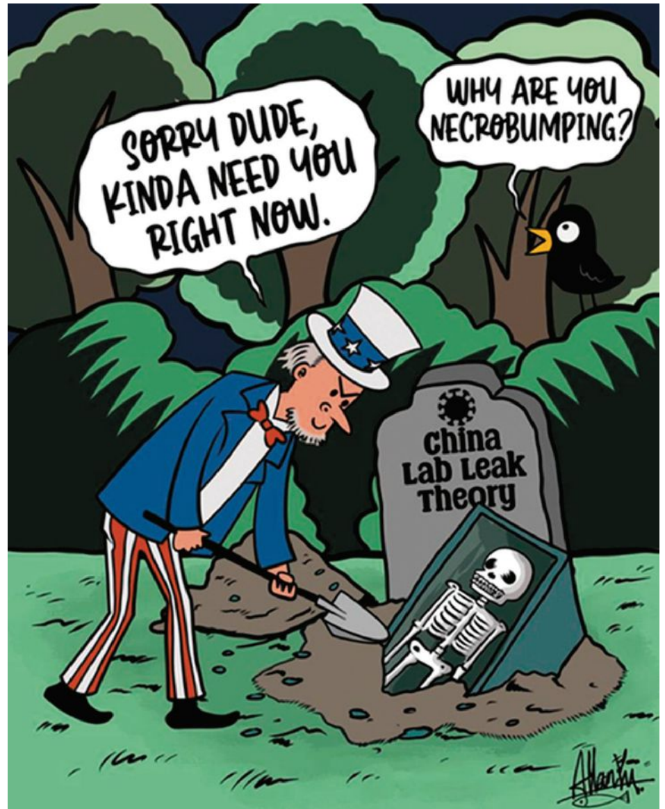
CARTOON: PEOPLE'S DAILY

In January 2021, a United Nations delegation of scientists and health