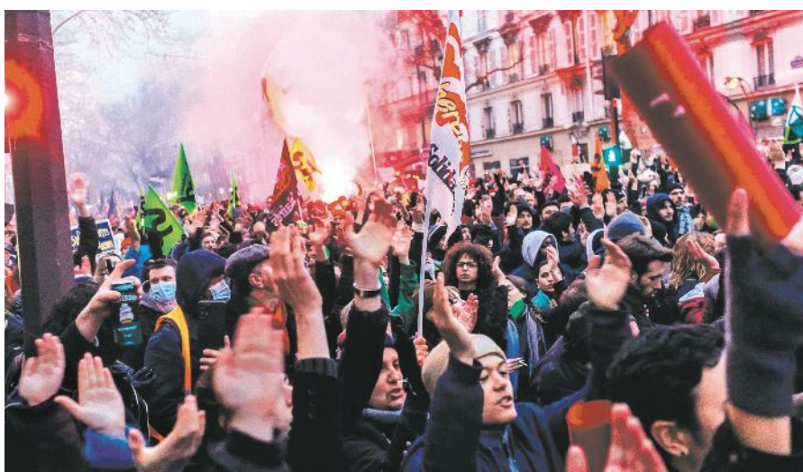
Workers across France continue militant protests against attacks on pensions.