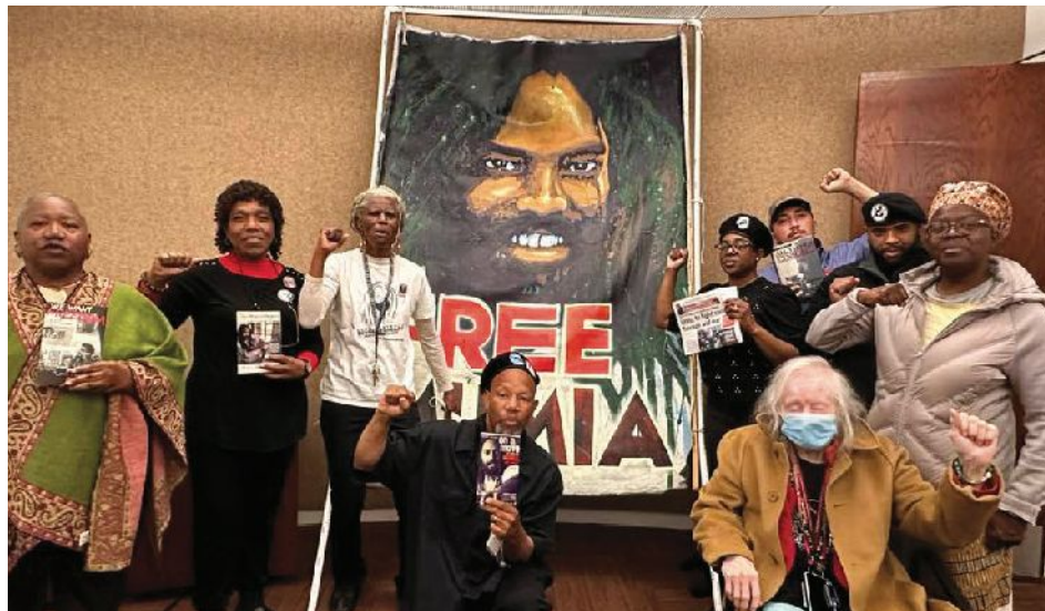
San Diego, March 11.

Mumia needs our help more than ever. We need to show the world that millions in the United States are fighting for justice for Mumia. We understand that the outcome of this campaign to free Mumia will reflect on what happens to many of our loved ones who find themselves detained or imprisoned in this corrupt criminal justice system. We must understand that an injustice to one