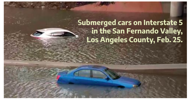
Submerged cars on Interstate 5 in the San Fernando Valley, Los Angeles County, Feb. 25.

Climatologists have come to realize that the consequences of burning fossil fuels are coming faster than anticipated. This is a global emergency. Capitalism is, in fact, the “existential” threat. The dominance of energy corporations, banks, and other mega-corporations must come to an end. 📌