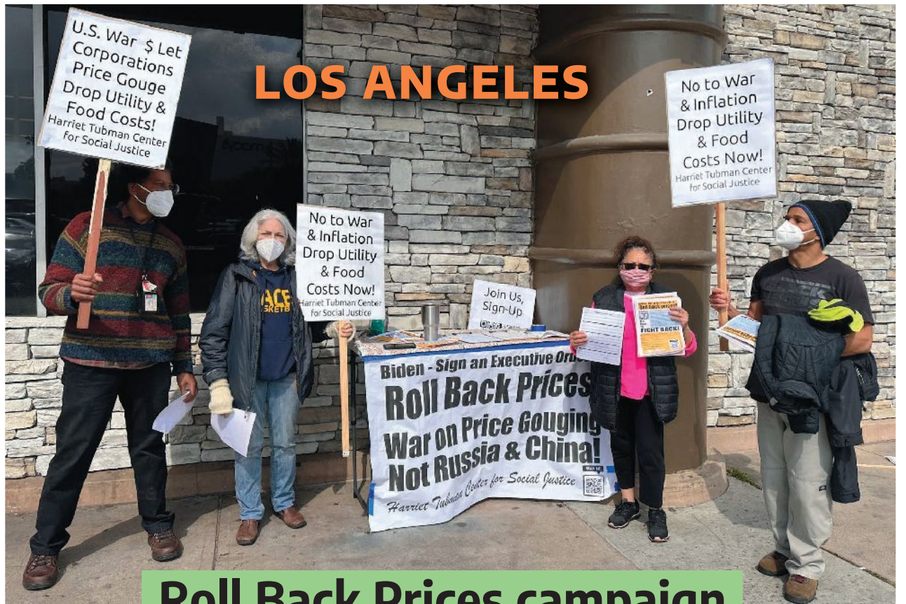
Roll Back Prices campaign