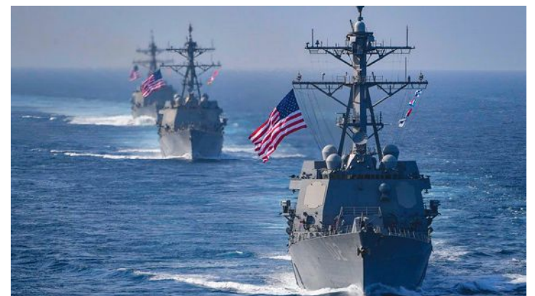
U.S. warships sailing in the Black Sea.

“World War II's massive destruction cemented Wall Street's position at the center of the world economy. In 1945 the U.S. produced 50 percent of global GDP and held 80 percent of the world's hard currency reserves. The war made the dollar the world's reserve currency,” he said.