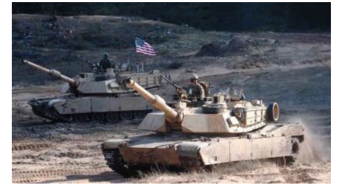
: U.S. Army M1A1 Abrams tanks in NATO battle group exercise in Adazi, Latvia.

“It is why the U.S. encouraged the Kiev regime’s bloody eight-year war against the people of Donetsk and Luhansk. Washington has pushed NATO expansion precisely to build a wall