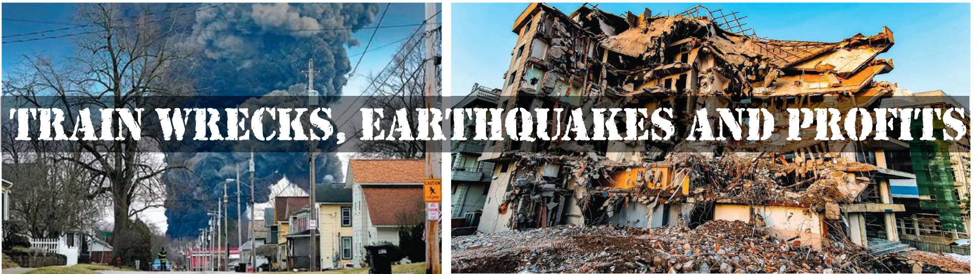
Toxic mushroom cloud rises over East Palestine, Ohio.