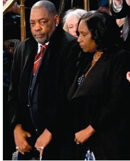
Tyre Nichols parents at the Capitol for the State of the Union. After a brief acknowledgment, Biden went on to a lengthy praise of the police.

On the other hand, no one should give Joe Biden a pass. Rather than defund the police, he increased their budget. And after a brief acknowledgment of the Nichols family, Biden then went on to a lengthy praise of the police in general.