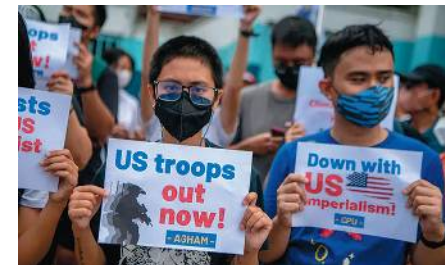
Protesters at Philippine military headquarters.

On Jan. 13, Japan's prime minister, Fumio Kishida, met with Biden