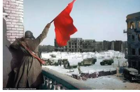
80 years ago: Red Army soldier raises victory flag over Stalingrad, February 2, 1943. The victory was the turning point in the defeat of the Nazis.

The dam broke in the fall of 1918. The masses were sick of war and starvation. German workers went on strike while soldiers and sailors refused to kill other poor people.