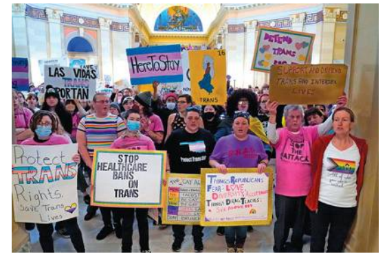
Protesters defending trans lives pack the Oklahoma State Capitol on Feb. 6.

Actions like the one in Oklahoma City are needed — more of them, many more — in every state capitol coast-to-coast. And those actions must grow with solidarity from organized labor, communities fighting racist police brutality, and the censorship of Black history in schools, women's rights, and an-