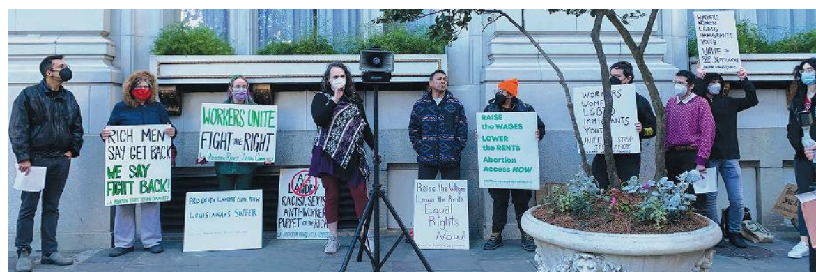
LARAC press conference outside the Roosevelt Hotel

Landry met with other Republican attorneys general in the "Forbes Travel Guide verified luxury" Roosevelt Hotel. Down on the street, the Louisiana Abortion Rights Actions Committee (LARAC) held a news conference to expose oil profiteer Landry, who has used his office to block Medicaid expansion, limit abortion rights, and much more. His