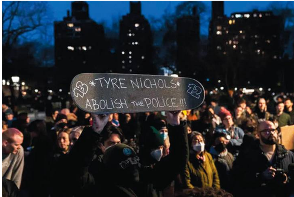
Protests after Tyre Nichols's death.

So, for the sake of all those continuing to be killed by cops this year and the preceding years, we must never give in to hopelessness and allow the powers that be to discourage us from fighting back against this racist capitalist system, nor allow them to deny the role that racism plays in this system.