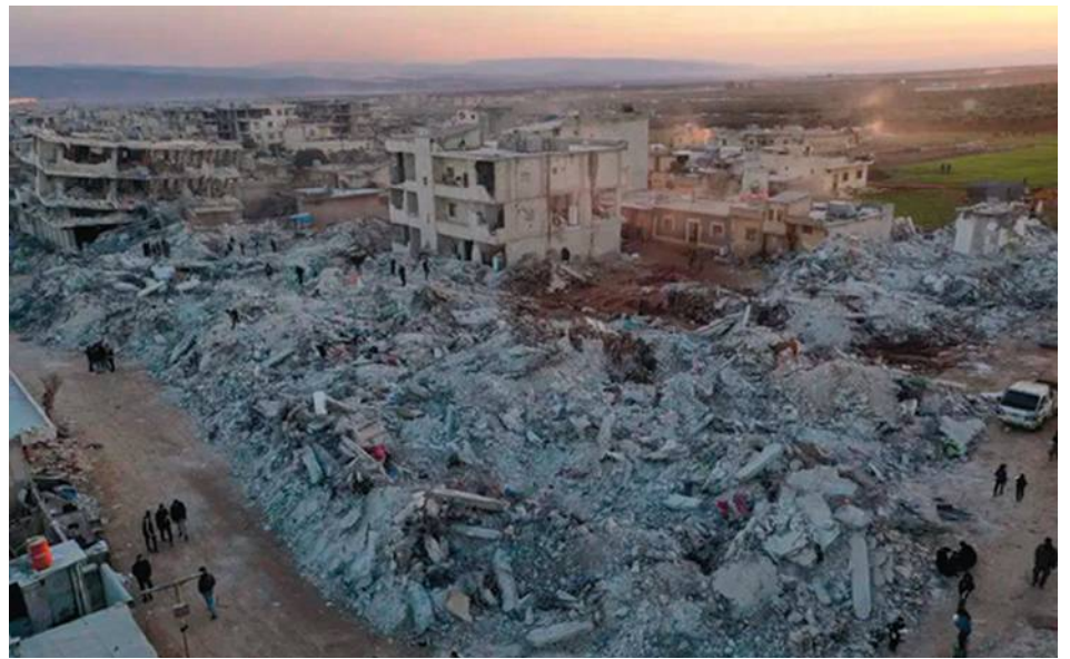
Collapsed buildings in the town of Jinderis, Aleppo province, Syria, Thursday, Feb. 9, 2023. The quake that razed thousands of buildings was one of the deadliest worldwide in more than a decade.