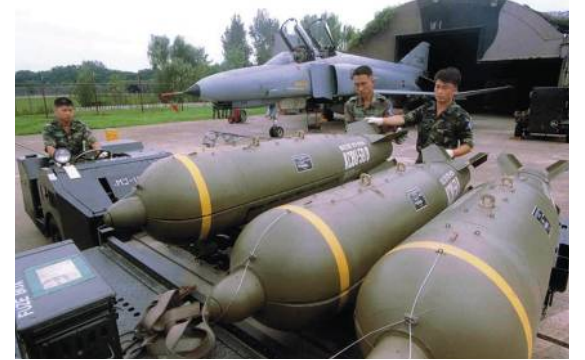
South Korean Air Force personnel prepare to load U.S.-made and supplied cluster bombs — internationally banned weapons — during an exercise in 2017 at an air base in Suwon, South Korea.

In a report on “9 weapons banned from modern warfare,” Blake Stillwell says: “A cluster bomb releases