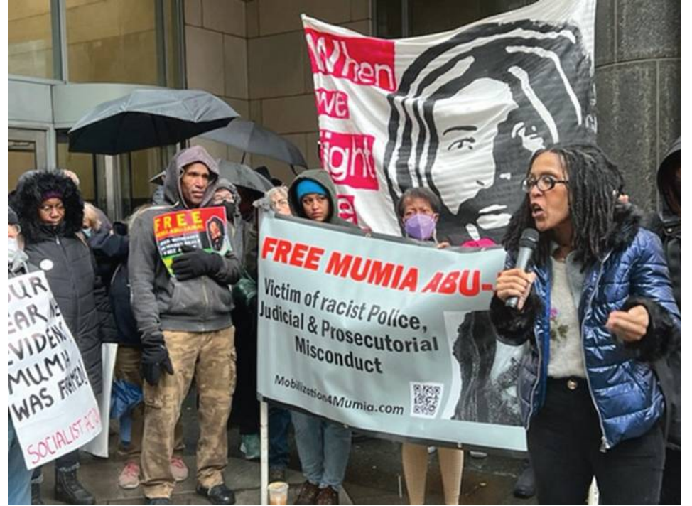
Philadelphia, Dec. 16.