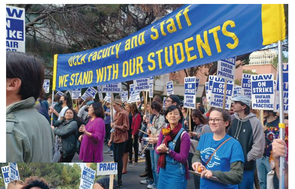
Striking UCLA workers march on Nov. 28.

SLL: Can you explain what kind of work and research are done by UC