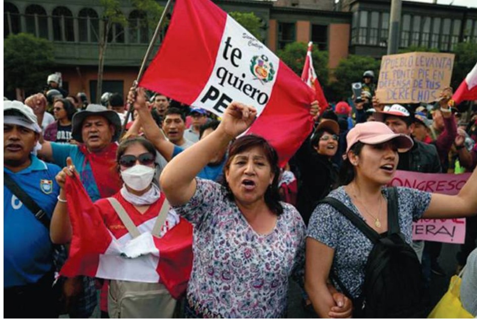
Supporters of President Pedro Castillo gather in front of Congress in Lima, Peru, Saturday, Dec. 10, 2022.

Congress's decision to remove Castillo from office came after he tried to dissolve it, and that political move gave his former vice president Dina Boluarte a free hand to abandon Castillo's loyalty, which got her there in the first place, to take his seat. The bottom line is that the coup was orchestrated by the rich elites of the country with encouragement from abroad.