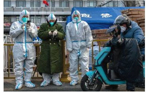
Epidemic control workers wear PPE to prevent the spread of COVID-19 as they stand next to equipment for cold weather in an area where some communities are under lockdown on Nov. 29, 2022, in Beijing, China.

While China is now on its way to achieving a higher GDP than the U.S., it is still a developing country, and building a complete health care system is an ongoing process. When COVID emerged China still had only