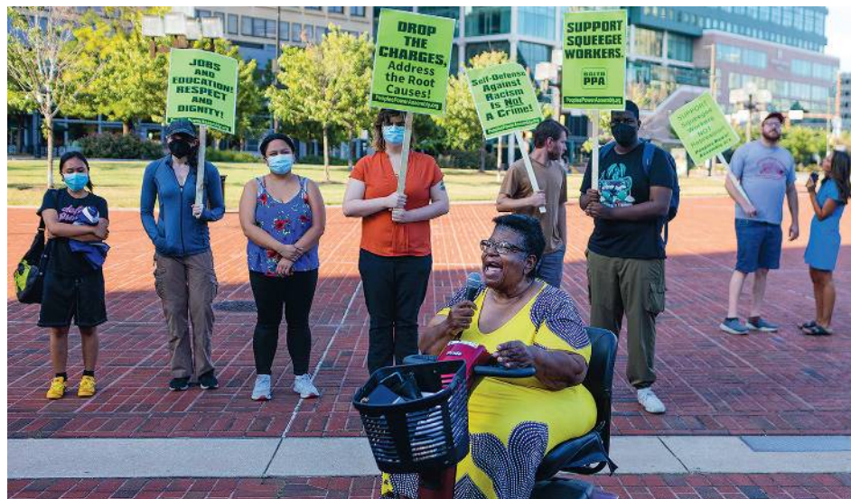
Protesters in downtown Baltimore denounce the arrest of a 15-year-old African American squeegee worker for an act of self-defense, Aug. 2.

As Struggle-La Lucha has previously reported, the prosecution of this 15-year-old Black teenager has continued since the teen was charged with first-degree murder in August. The teen's indictment included seven other charges. He was charged as an adult on all counts,