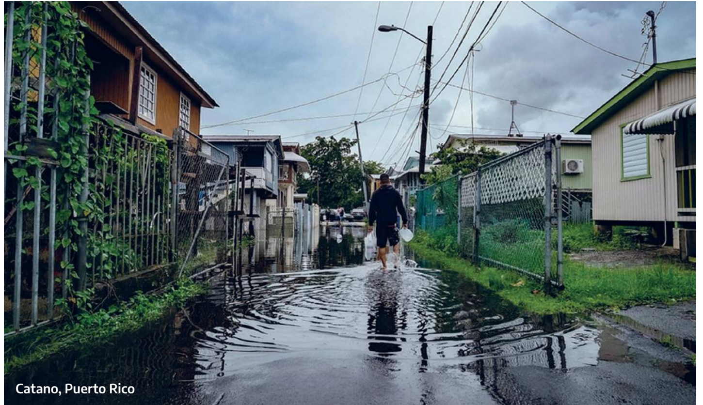
Catano, Puerto Rico

And the fault lies with the irresponsible inaction of the govern-