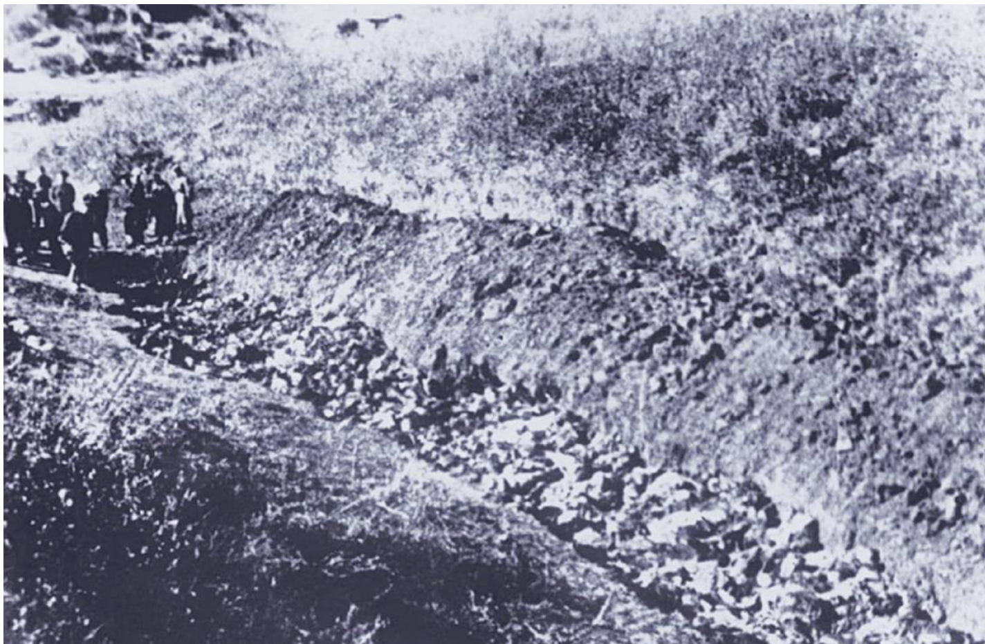
On September 29-30, 1941, more than 30,000 Jews were killed in Babyn Yar, Ukraine, in what was one of the largest massacres to be perpetrated during the Jewish/Roma Holocaust.