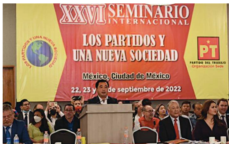
Tran Duc Thang, of the Communist Party of Vietnam, addresses the 200 delegates from political parties of 30 countries at the international conference of "Political parties and a new society" in Mexico City from September 22-24.

It is shameful that in the twenty-first century, the United States possesses Puerto Rico as a colo-