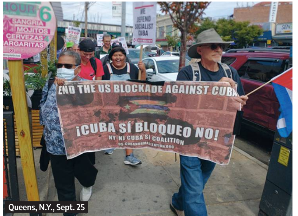
Queens, N.Y., Sept. 25