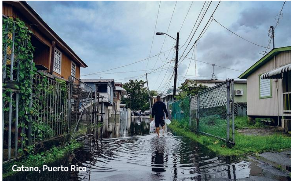
Catano, Puerto Rico

Además, el gobierno, obedeciendo la Junta de Control Fiscal ha impuesto privatizaciones que han sumido a condiciones de mucho sufrimiento al pueblo, como la privatización de la energía bajo la compañía estadounidense-canadiense Luma Energy que ha probado que no tiene ni los saberes, ni la experiencia, ni la fuerza trabajadora suficiente para bregar con la infraestructura eléctrica del país. Gracias a la torpeza de Luma, la mitad del país se mantiene sin la electricidad suficiente para llevar a cabo sus labores esenciales.