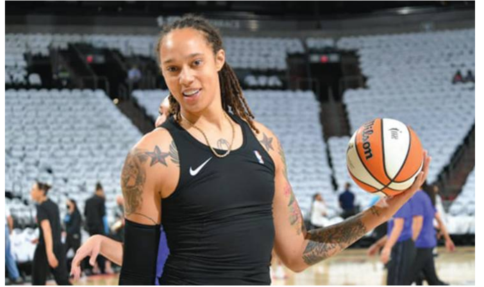
Brittney Griner during Game Two of the 2021 WNBA Finals.

Biden & Co. ignored Brittney Griner's plight for months, refusing to negotiate with the Russian authorities in good faith while they were busy setting up the war crisis in Ukraine and vicious sanctions on Russia. Griner's case might never have reached the point of a trial or conviction had Washington acted differently.