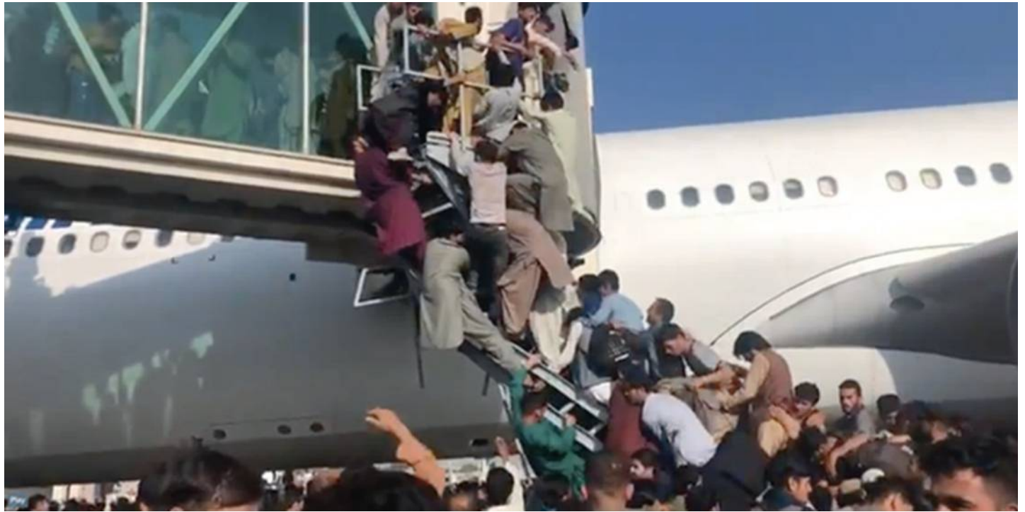
The world witnessed images of desperation during U.S. troop withdrawal in 2021. Today Washington continues its decades-long sabotage of Afghanistan.

It was the CIA's Operation Cyclone that turned the attempts at progress back. The spy agency re-