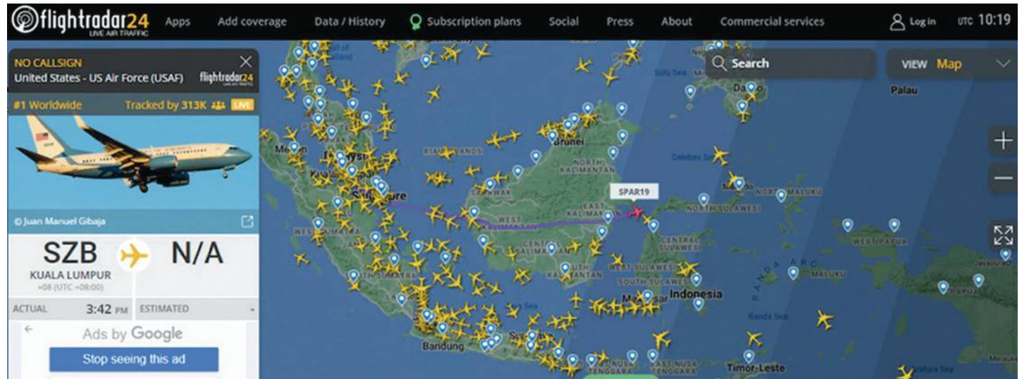
SPAR19 — a U.S. Air Force plane carrying House Speaker Nancy Pelosi from Malaysia to Taiwan, as seen on a Flightradar24 map.

Words and treaties are one thing with U.S. imperialism, but deeds are another. The Indigenous Nations could attest to this.