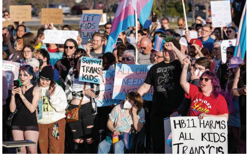
Protest against state ban on trans girls' participation in school sports at the state capitol in Salt Lake City. Laws like Utah's HB11 have been used as the starting point for broad attacks on trans people's rights.

The speed with which the attack on trans people has escalated this year is truly frightening. From state bills in several Republican-ruled states, which often went down in defeat; to governor-imposed mandates; to