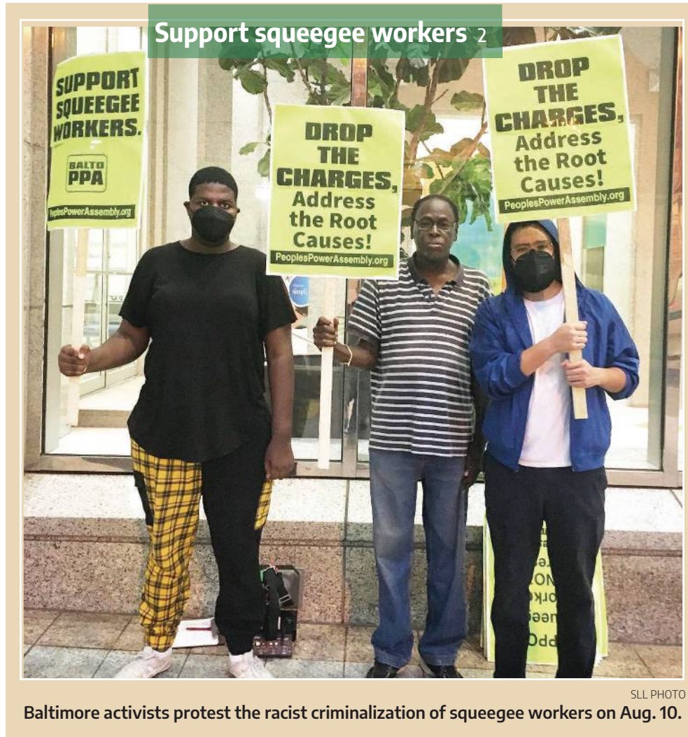
Baltimore activists protest the racist criminalization of squeegee workers on Aug. 10.

The assassination was most likely a test, a show by the imperialists that they could strike in the heart of Moscow.