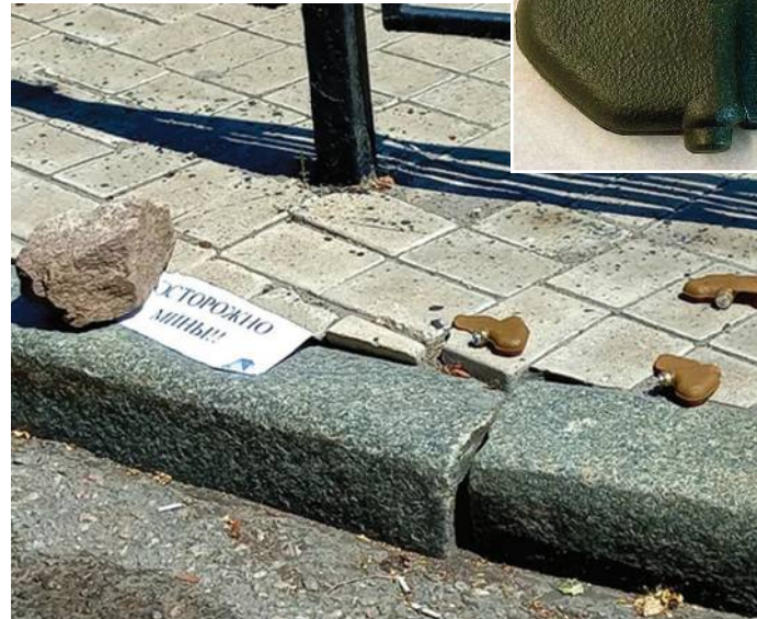
An example of the ‘petal’ antipersonnel mines scattered by Ukraine through the streets of Donetsk and other Donbass cities.

Ben also quotes Biletskyi in 2010 saying the Ukrainian nation’s mission was to “lead the white race of the world in a final crusade ... against Semite-led Untermenschen.” Untermenschen is an unscientific term used by Nazi Germany, implying an ethnic designation. They are sup-