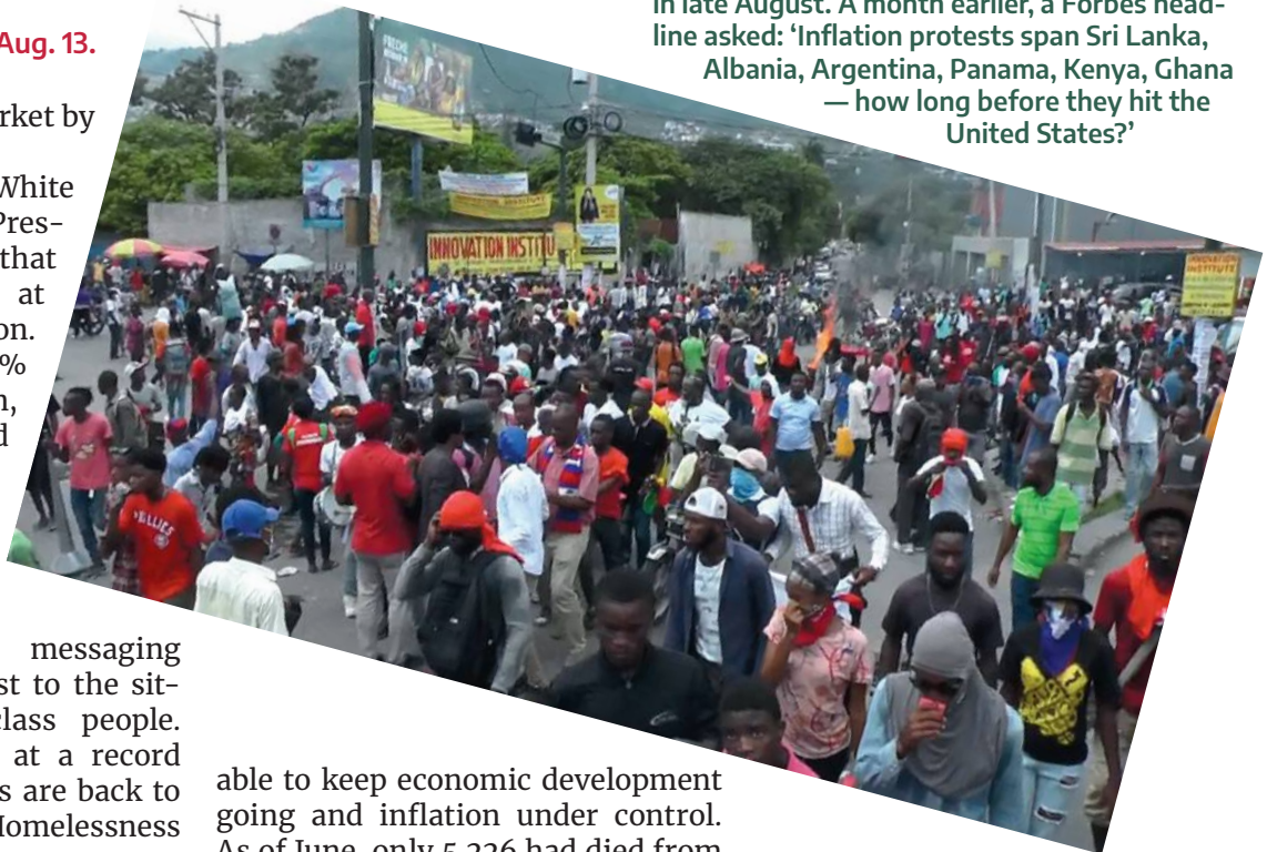
Mass protests fueled by inflation swept Haiti in late August. A month earlier, a Forbes headline asked: ‘Inflation protests span Sri Lanka, Albania, Argentina, Panama, Kenya, Ghana — how long before they hit the United States?’

That's with major supply-chain and other economic disruptions that result from the Chinese government's continued commitment to a Zero-COVID policy; surely, the disruptions of Shanghai's two-month shutdown are not ideal from an economic perspective, but China is still