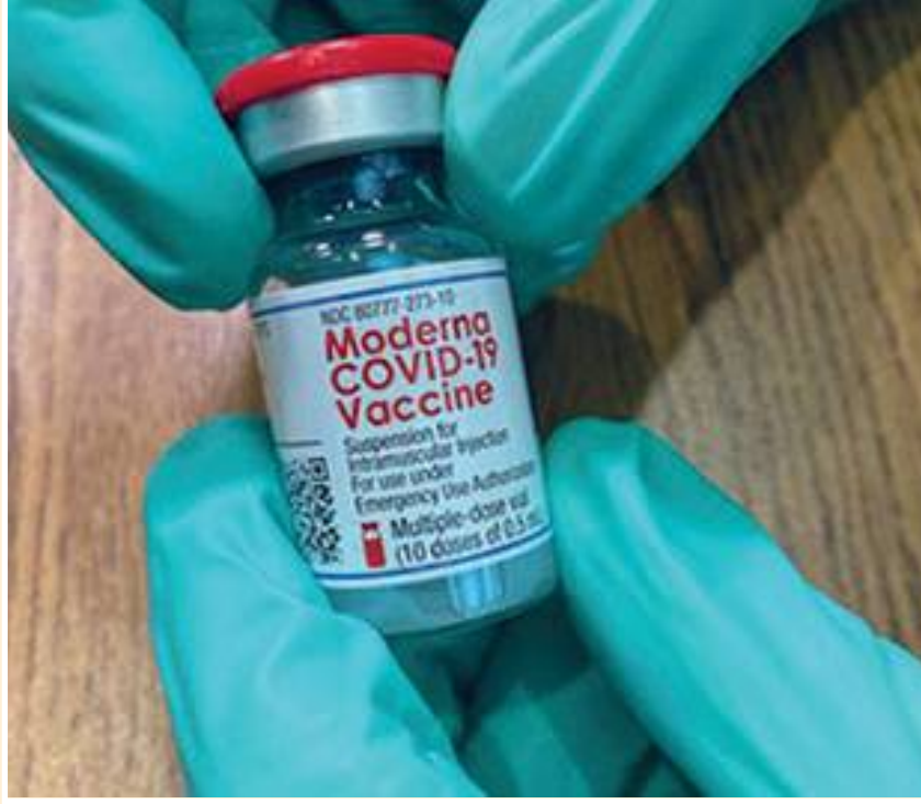
The collective wealth of Moderna's three top shareholders — Noubar Afeyan, Robert Langer and Timothy Springer — ballooned to $12.7 billion because of vaccine sales.

That's typical behavior for the big drug outfits known as Big Pharma. Every minute BioNTech, Moderna and Pfizer are together collecting $65,000 in profits from their