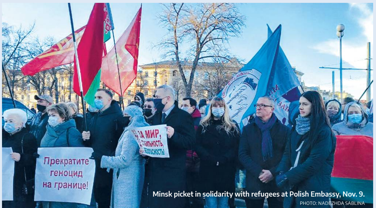
Minsk picket in solidarity with refugees at Polish Embassy, Nov. 9.

To sign the statement, email refugeesolidarityvs nato [at] gmail [dot] com