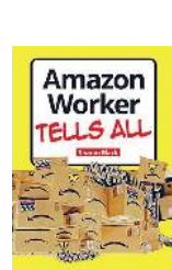
Amazon worker tells all

The people of Cuba trust the vaccines because the country has a long history of preventative health care that is steeped in education and community implementation. There is no profit requirement to block health care in Cuba.