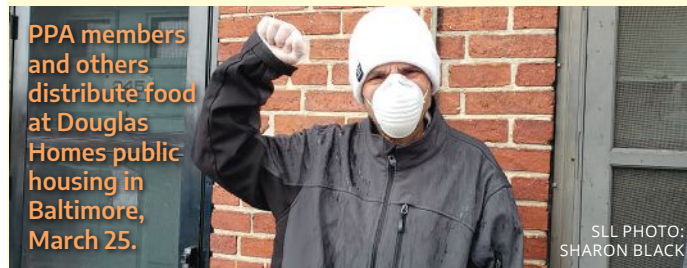
PPA members and others distribute food at Douglas Homes public housing in Baltimore, March 25.