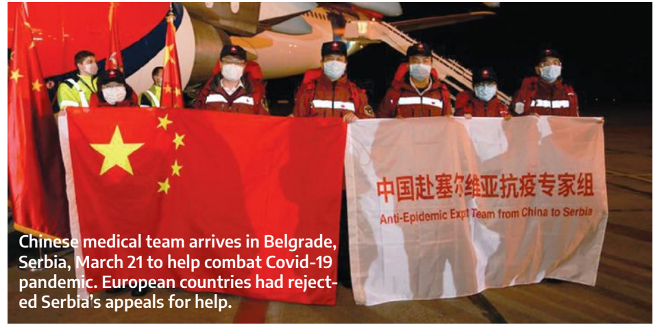
Chinese medical team arrives in Belgrade, Serbia, March 21 to help combat Covid-19 pandemic. European countries had rejected Serbia's appeals for help.

The continuing fall of the stock market reflects the general instability in the capitalist mode of production for profit. The economy was already slowing, contracting in a cyclical capitalist crisis. Capitalists call it a profit crisis as the produced commodities cannot be sold at profit. That's the crisis that triggers a major economic downturn, a full-on recession or even a depression. ☐