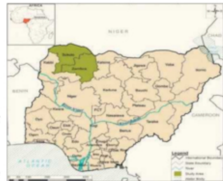
Map of Nigeria highlighting Sokoto State, site of U.S. Christmas airstrikes, and Zamfara State, a neighboring region affected by ongoing violence in northwest Nigeria.