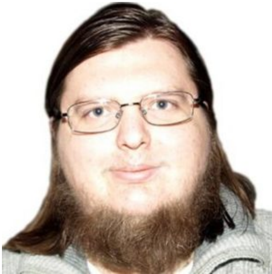
Yuri Sheliashenko

attempted to bribe officials, and others have been found dead in rural border areas.