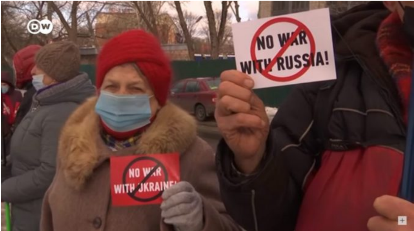
Protesters holding signs that read, “No war with Russia” (right) and “No war with Ukraine”