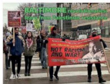
BALTIMORE revolutionaries, fear from Palestinian resistance

At Trump's coronation, thousands vow to fight billionaire oligarchy