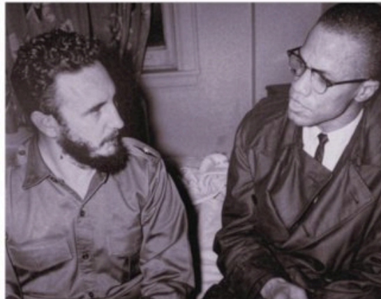
Malcolm X and Fidel Castro met in 1960 at the Hotel Theresa in Harlem.

The assassination had signs of involvement by the FBI, which targeted for assassination members of the Black Panther Party, like Fred Hampton in Chicago.