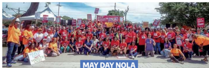
New Orleans