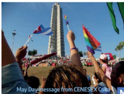
May Day message from CENESEX Cuba