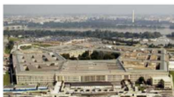
The Billionaire-Military Complex - The Pentagon.