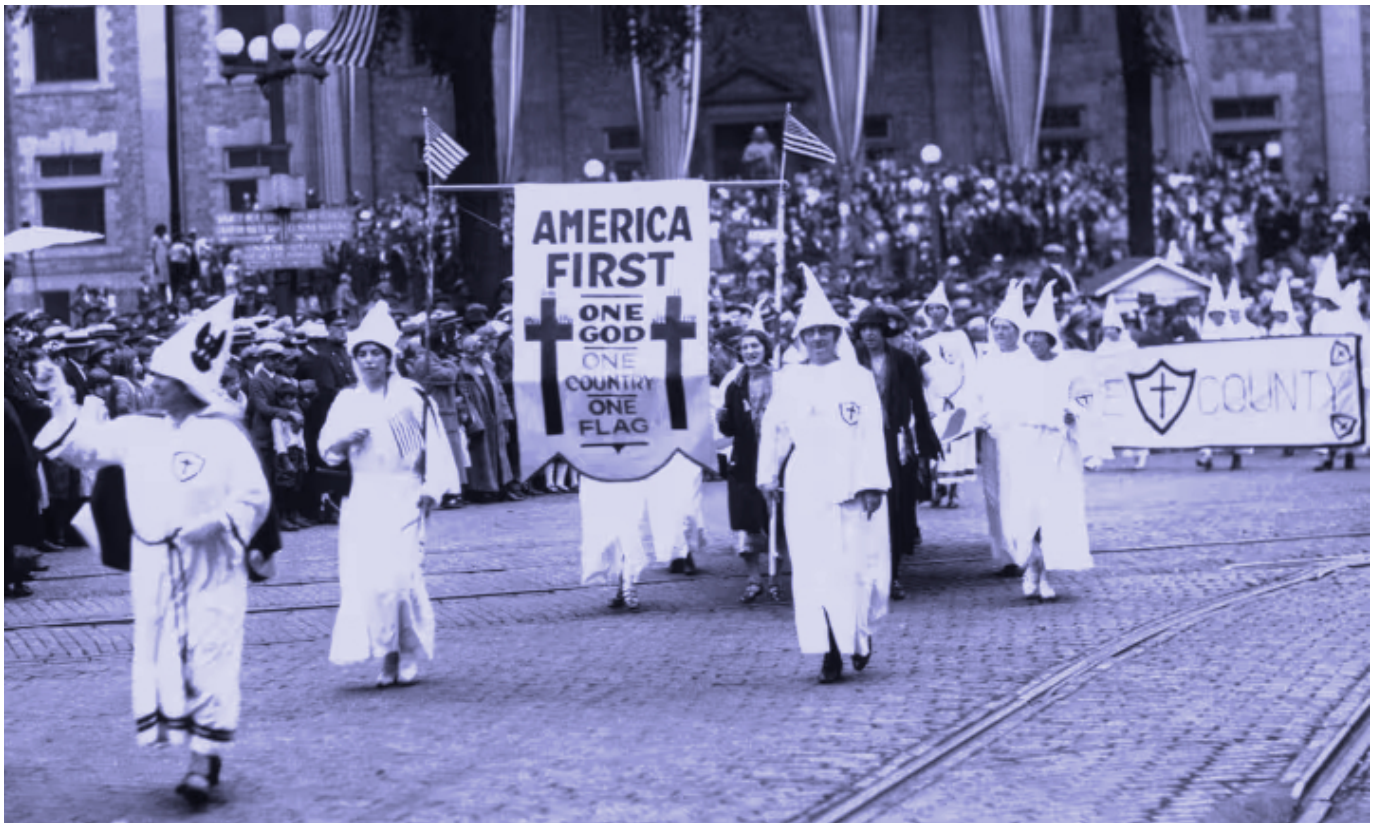
A Klan march in Binghamton, New York, in the 1920s.

disunited so they can't fight our real enemies, the rich. And this picture of a Klan rally [in PowerPoint] isn't from the 19th Century. It's from the 20s in New York, but I thought that was a really good one because you see exactly where the "America first" slogan came from. You could put this right into 2025, "one God, one country, one flag" — it's all the same stuff.