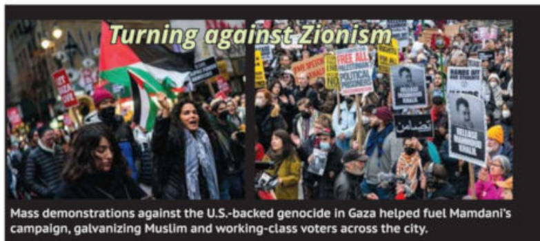
Mass demonstrations against the U.S.-backed genocide in Gaza helped fuel Mamdani's campaign, galvanizing Muslim and working-class voters across the city.

Erasing Black History: From Florida to the Netherlands