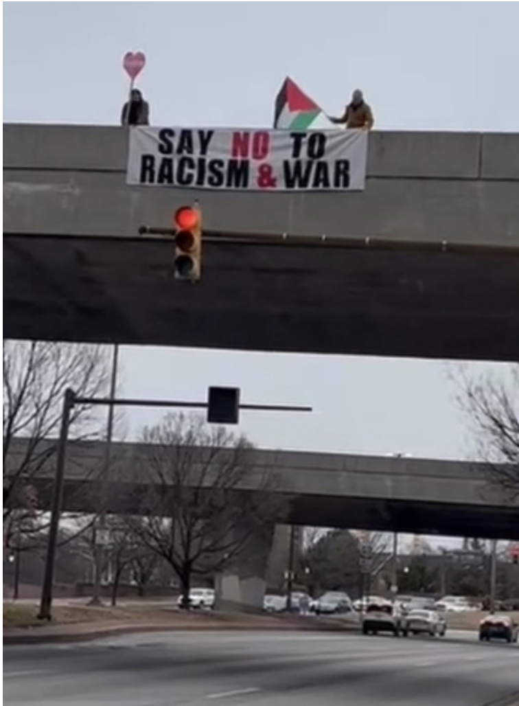
W Mulberry St & W Franklin St over MLK Blvd - “Say NO to Racism & War”