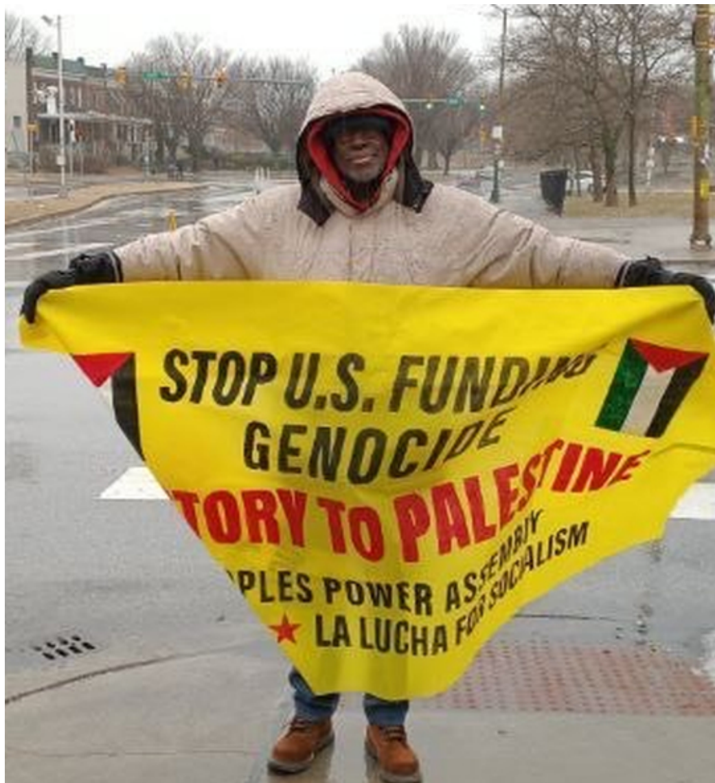
Gwynn Falls and Pennsylvania Ave. - "Stop U.S. Funding Genocide - Victory to Palestine"