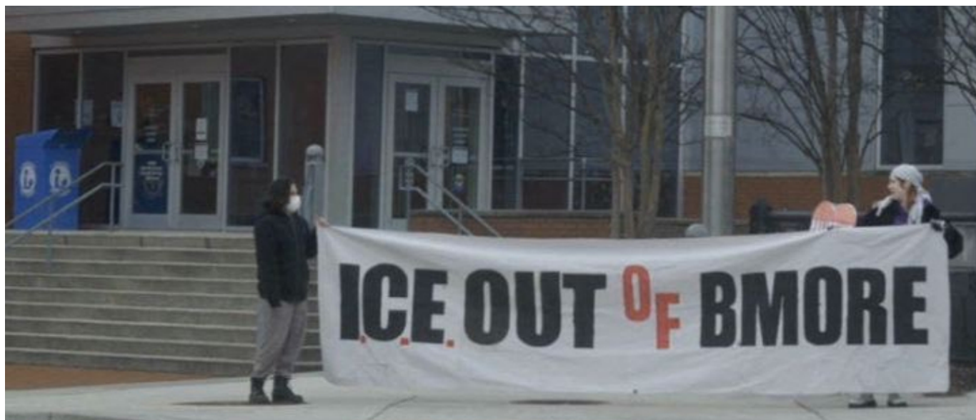
Enoch Pratt Free Library – Southeast Anchor Branch – “ICE Out of BMore”