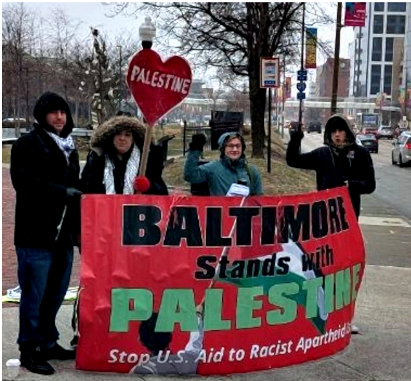
Pratt St & Light St - "Baltimore Stands with Palestine - Stop U.S. Aid to Racist Apartheid Israel"