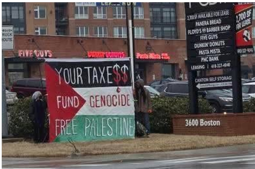
S Conkling St & Boston St - "Your Taxe$$ Fund Genocide - Free