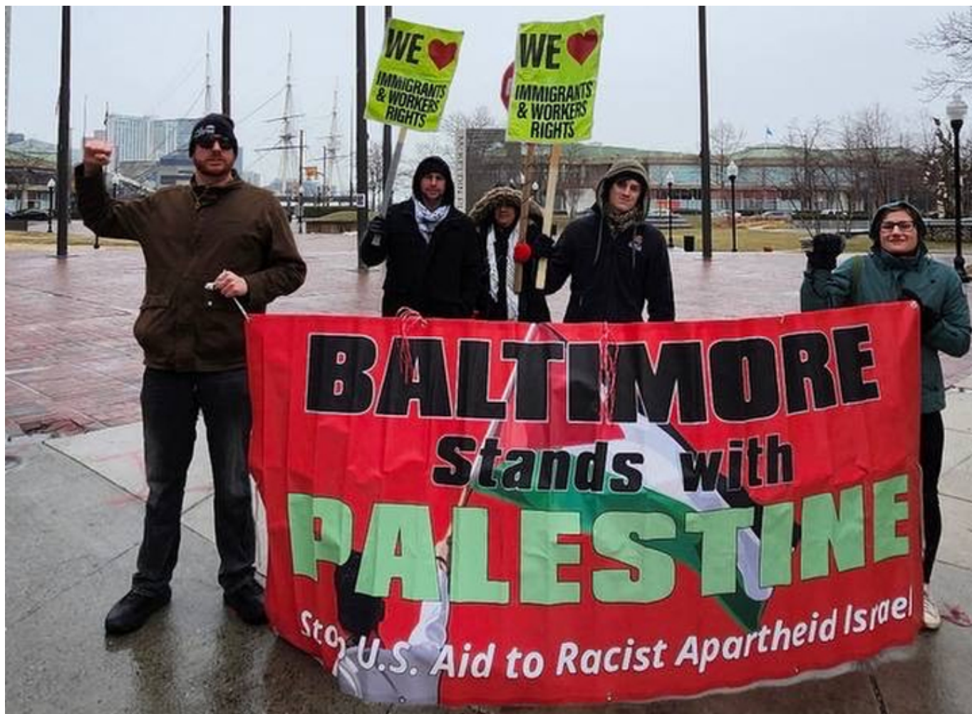
Pratt St & Light St - "Baltimore Stands with Palestine - Stop U.S. Aid to Racist Apartheid Israel"