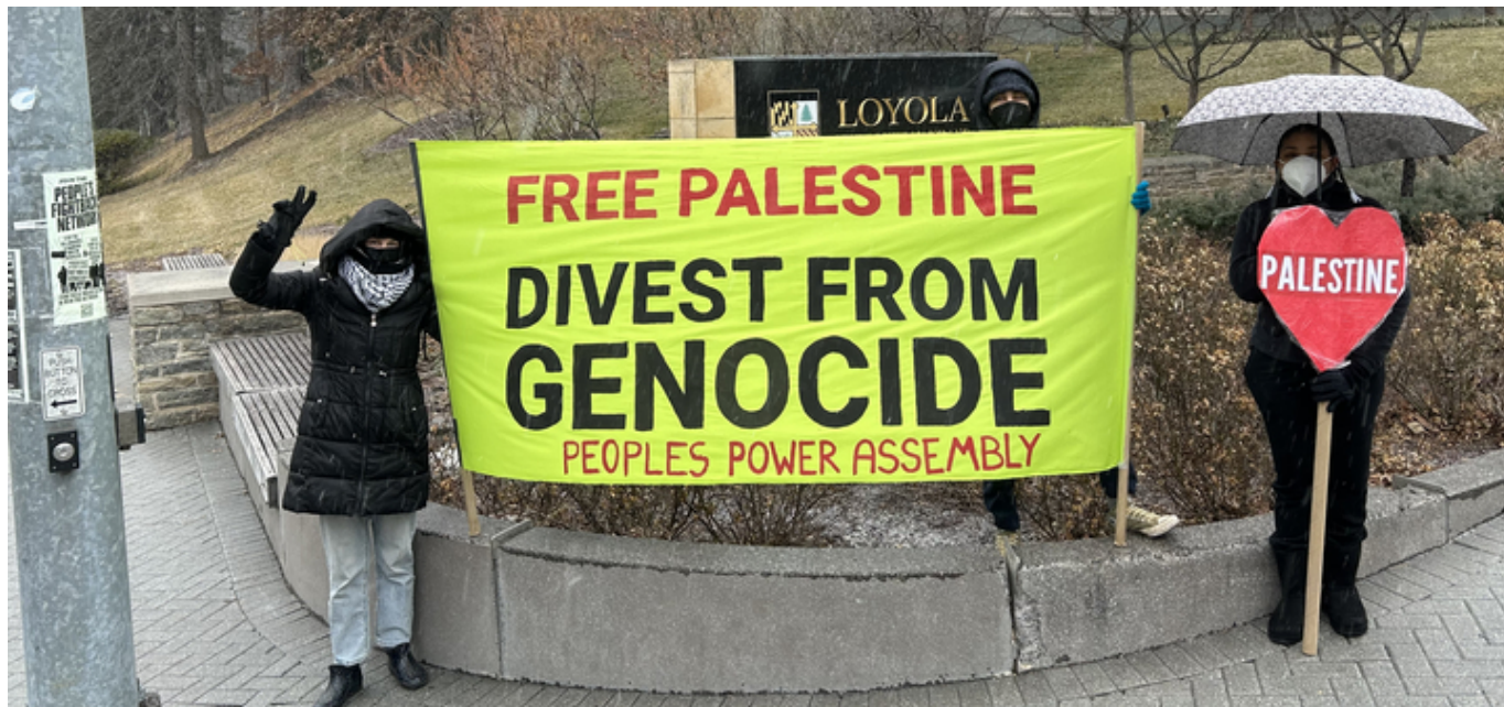
Charles St & Cold Spring Ln (Loyola University of Maryland) - "Free Palestine - Divest from Genocide"