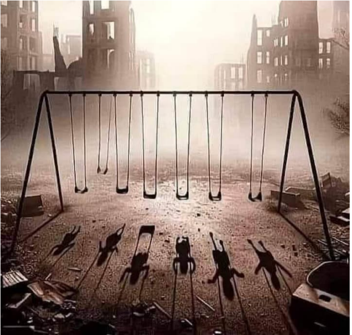
Street Art by Banksy in Gaza, Palestine.

Lenin wrote in “Imperialism, the Highest Stage of Capitalism”: