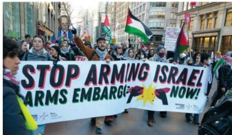
New York City protest on Feb. 16. See page 3.

For years, Zionist shock troops Continued on page 8