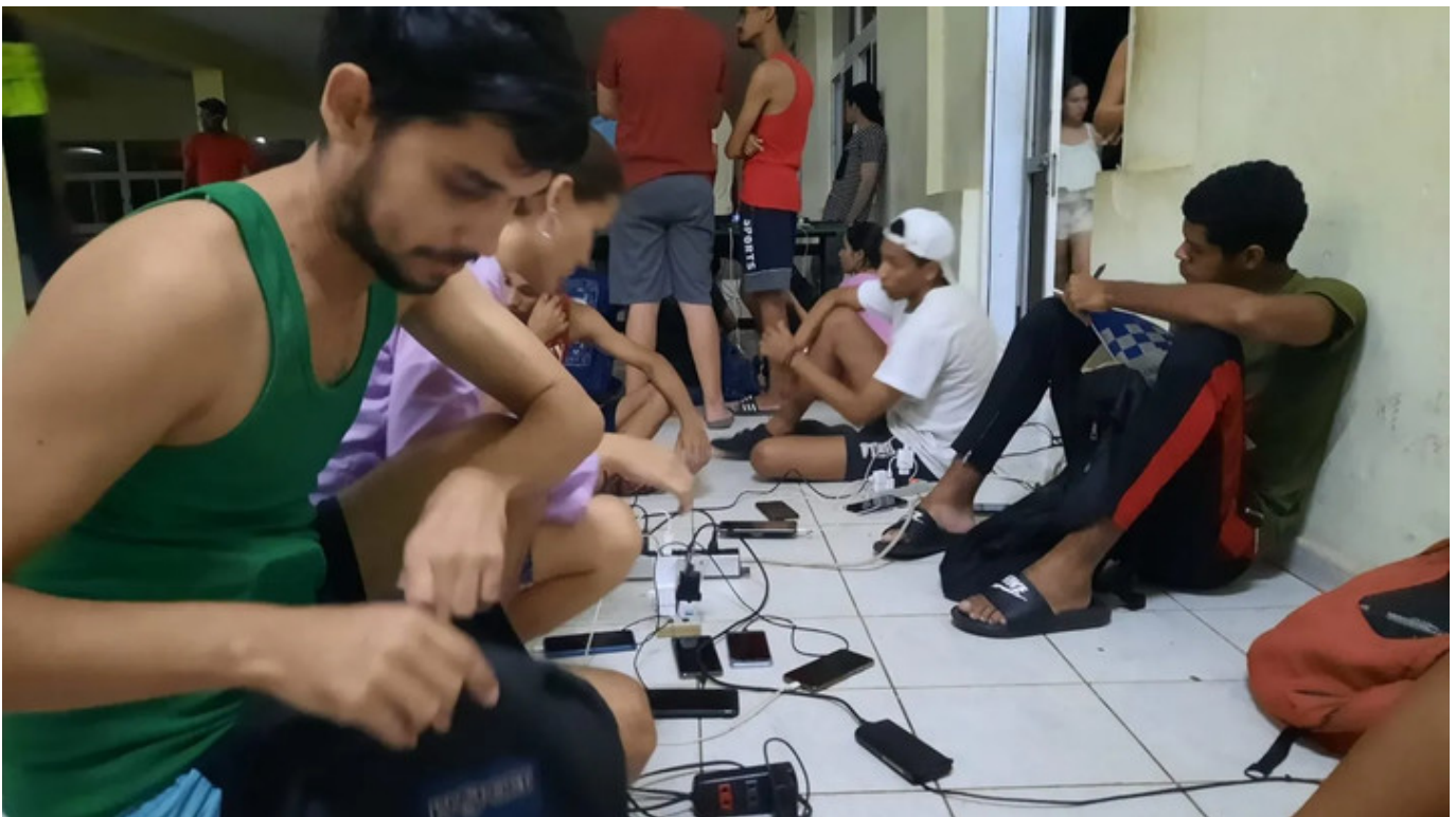
Students in Santa Clara charging their phones.

This week, the supply of electricity has been reduced by up to 50 percent on some days. As a result, authorities halted all non-essential state labor activities starting Friday, including ministries and schools. Diaz-Canel also stated that "there will be no rest" until electric service on the island is restored and emphasized that the situation is "tense and complex."