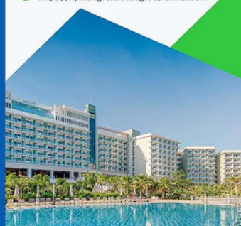
Meliá Internacional Varadero