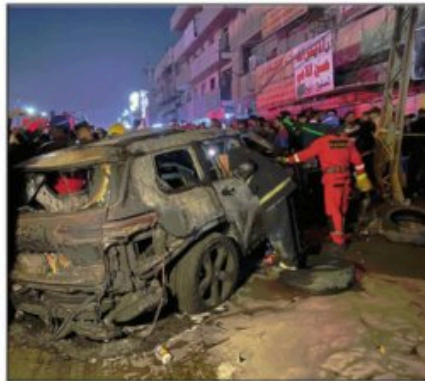
Emergency responders at the site of a burned vehicle hit by a U.S. drone strike in east Baghdad, Iraq, Feb. 7.

The White House's excuse for these devilish attacks was a drone that hit a U.S. base in Jordan near the Syrian border on Jan. 28. Three Black GIs from Georgia were killed.