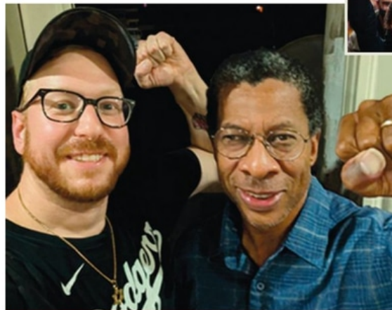
Global Conscience Convoy in Egypt

President Biden and both the Democratic and Republican parties continue